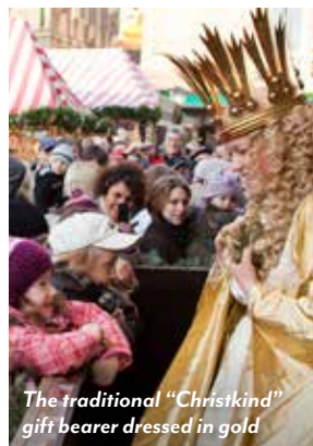
The traditional “Christkind” gift bearer dressed in gold

The concept of an open-air fair during December dates to 13th-century Vienna, when Duke Albrecht I granted permission for a market that would allow townspeople to gather supplies for the winter ahead. While historians say there is no evidence that this medieval market had any connection to religion, the popularity of the wintermärkte spread through German-speaking regions during the Middle Ages. By the 16th and 17th centuries, as festive Christmas celebrations became more commonplace in Austria and Germany, the winter market evolved into the more elaborate spectacle now known as the Christkindlmärkte — which translates to “Christ child market.” Delectable treats, handcrafted nutcrackers, wood carvings and other ornaments began to fill the market stalls. Nuremberg’s lovely Christkindlesmarkt, which you will visit, has been operating since at least 1628. In addition to Old-World Christmas decorations, the market is renowned for preserving the city’s famous rostbratwurst and the 17th-century lebkuchen gingerbread. Today, these centuries-old Christmas traditions continue in markets throughout Europe, which charm visitors with sparkling lights, fresh pine boughs, roasted chestnuts, mugs of glühwein and the merry sounds of carolers.