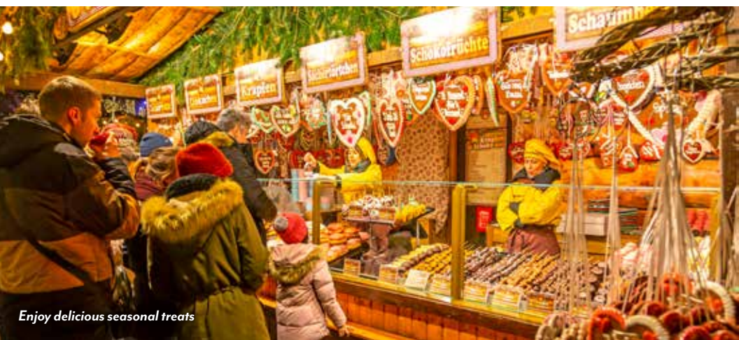
Enjoy delicious seasonal treats

Day 9 | December 16 Disembark the river boat this morning after breakfast and transfer to the airport for a flight back to your home city. (B)