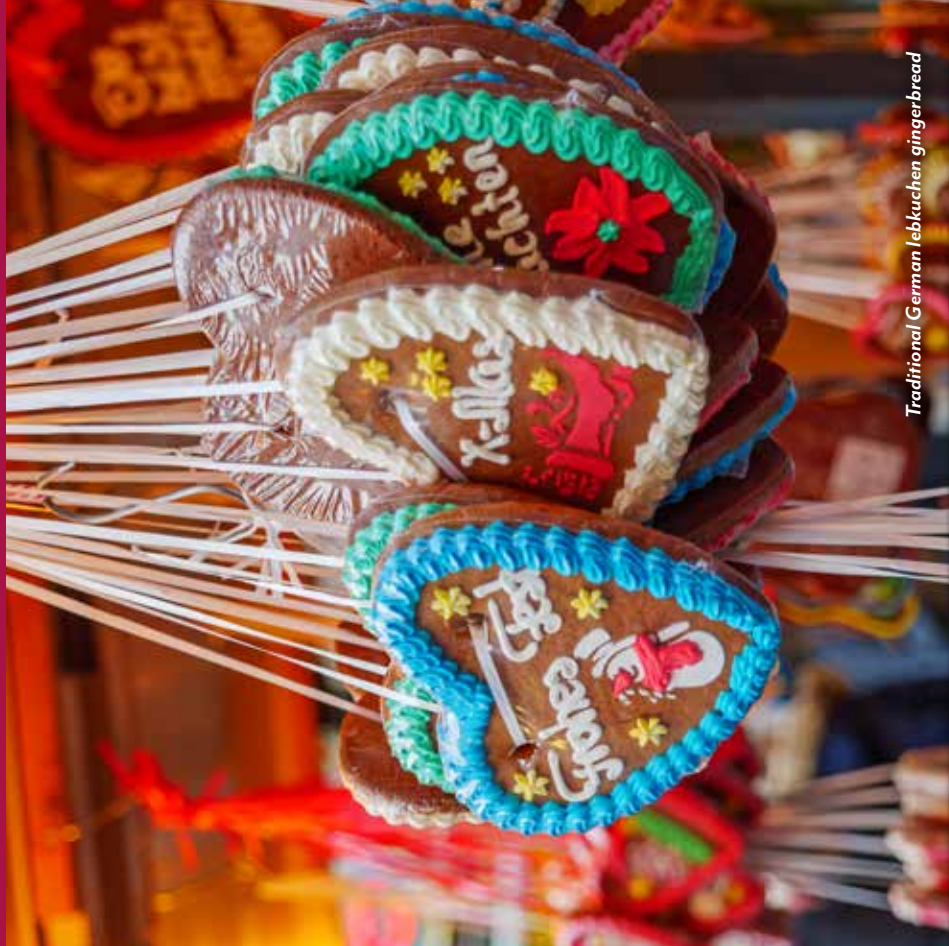
Traditional German lebkuchen gingerbread

Early Booking Savings* available | Save $2,000 per couple!