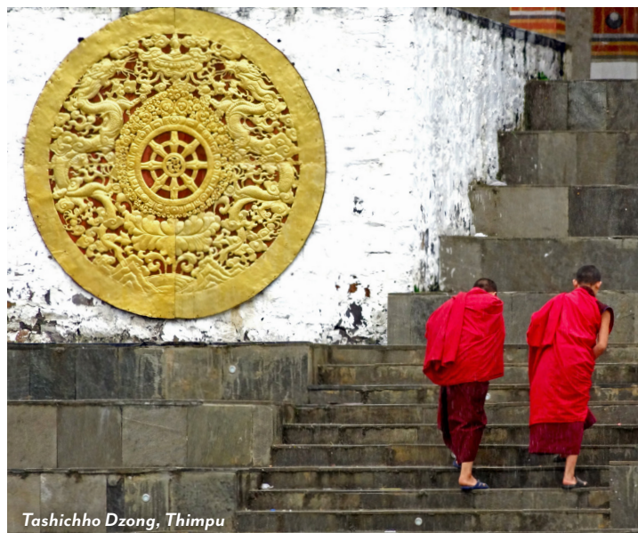
Tashichho Dzong, Thimpu

Bangkok | 5 days, 4 nights April 22 to 26, 2026 | Program Begins: April 24