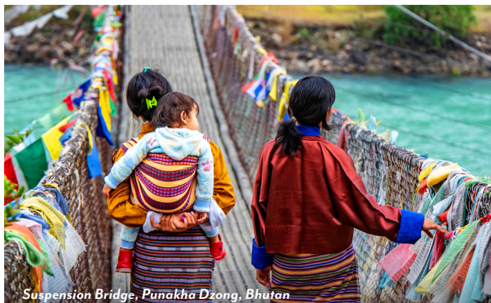
Suspension Bridge, Punakha Dzong, Bhutan

All Program Features are contingent upon final brochure pricing. 2026