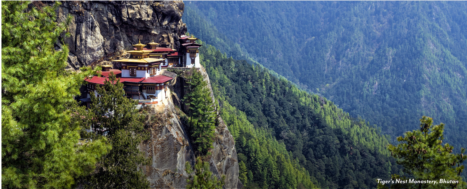
Tiger's Nest Monastery, Bhutan