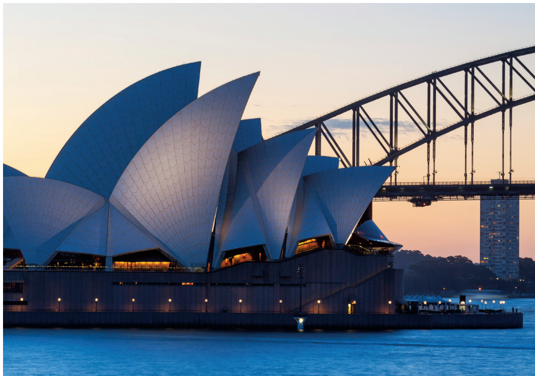
Sydney's signature Opera House and Harbour Bridge

Day 9: Cairns/Great Barrier Reef This morning we board a boat for a day-long excursion to the Great Barrier Reef, at 1,200 miles long the world's largest living organism and richest marine resource. We pull up at Michaelmas Cay where we can swim, snorkel, or view the reef from a semi-submersible vessel. B,L