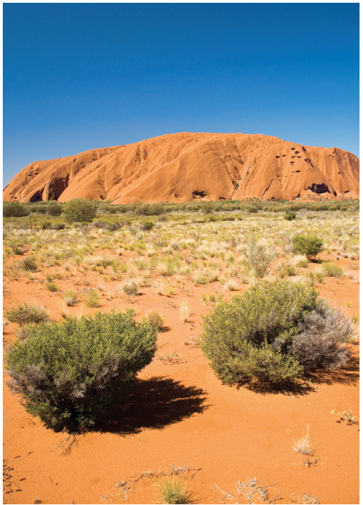
Aboriginal site of Uluru (Ayers Rock)