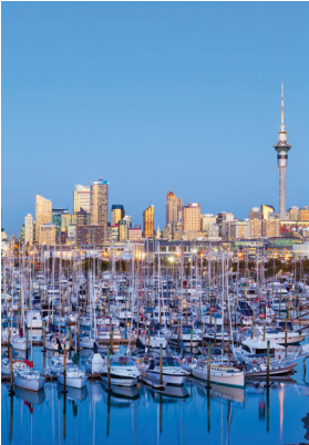
Auckland, City of Sails

Day 19: Rotorua This morning we visit Paradise Valley Springs, which showcases New Zealand’s biodiversity with native flora and wildlife, including alpaca, llama, and wallabies. Then we drive to National Kiwi Trust, dedicated to rehabilitating injured kiwis, the national bird. This evening we visit Te Puia Thermal Reserve and Cultural Centre for a traditional hangi dinner and Maori performance. B,D