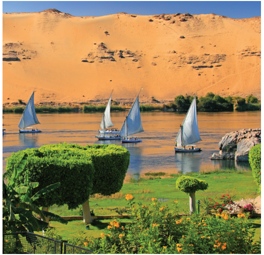
We sail traditional feluccas along the Nile.

Day 15: Depart for U.S. Very early this morning we transfer to the airport for our return flight to the U.S.