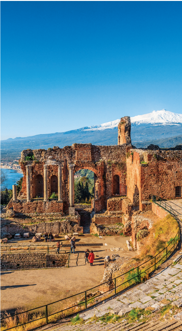
Taormina’s ancient theater overlooks Mt. Etna.

Day 12: Depart for U.S. We transfer today to the Catania airport for our return flight to the U.S. B