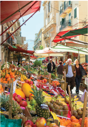
Colorful Sicilian street scene

Day 7: Agrigento/Piazza Armerina/Syracuse We travel across Sicily’s southern reaches today to Syracuse (Siracusa), stopping along the way in Piazza