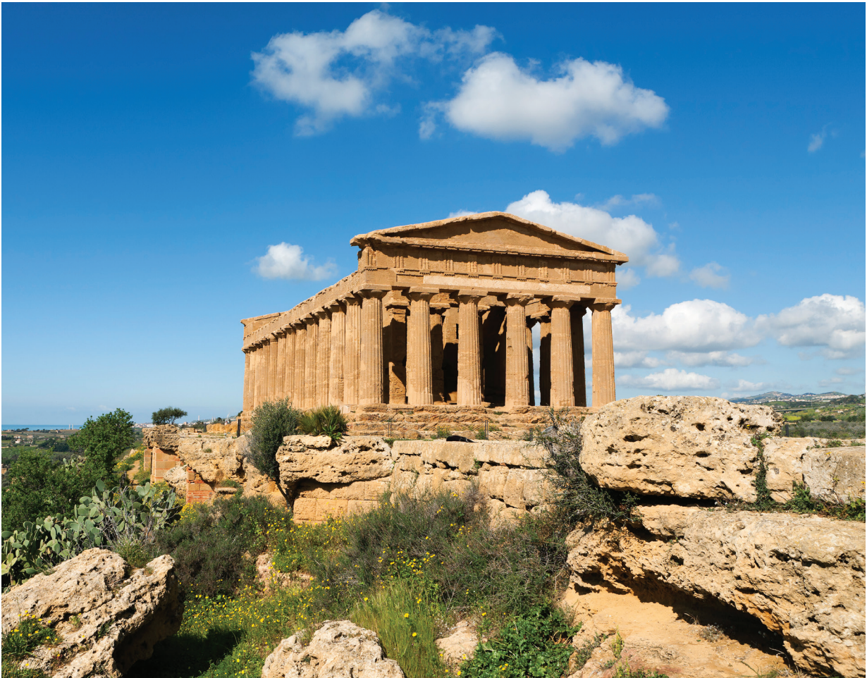
On Day 6, we explore the Valley of the Temples in hilltop Agrigento. Above: Temple of Concordia

Day 2: Arrive Palermo We arrive today in Palermo, capital of Italy’s autonomous region of Sicily. This evening we gather at our hotel for a briefing on the journey ahead, followed by a welcome dinner. D