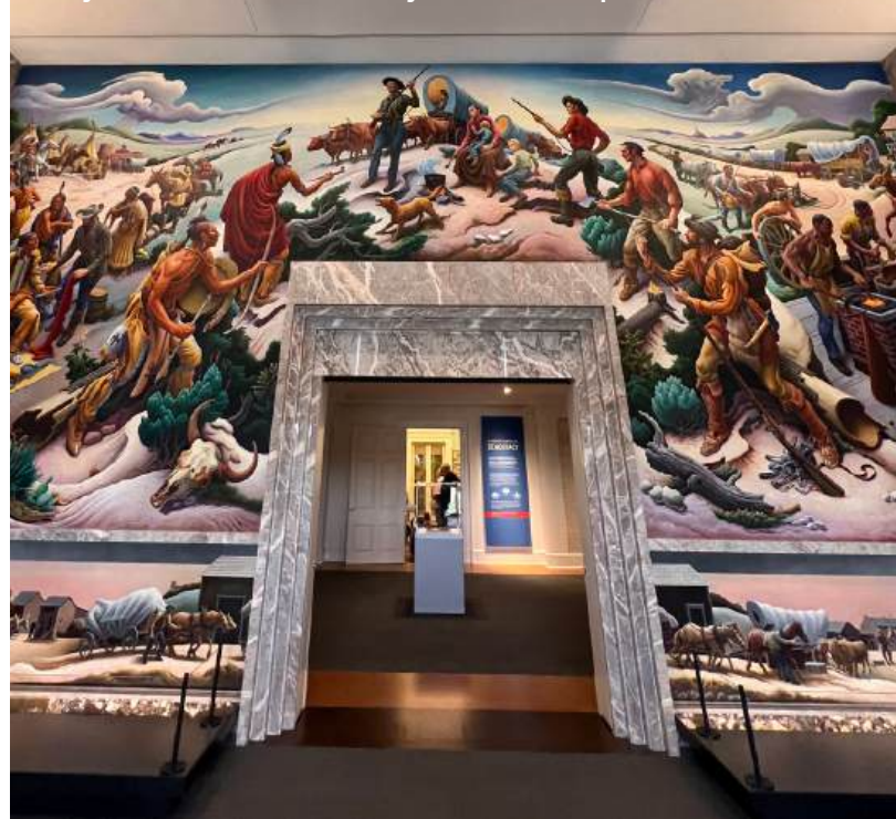
Independence and the Opening of the West , Thomas Hart Benton, Harry S. Truman Presidential Library & Museum, Independence

We then arrive in Bentonville , the home of the Crystal Bridges Museum of American Art, and check into our hotel. There is an optional evening visit to The Momentary , a satellite of Crystal Bridges housed in a repurposed 63,000-square-foot cheese factory. Dinner is at leisure.