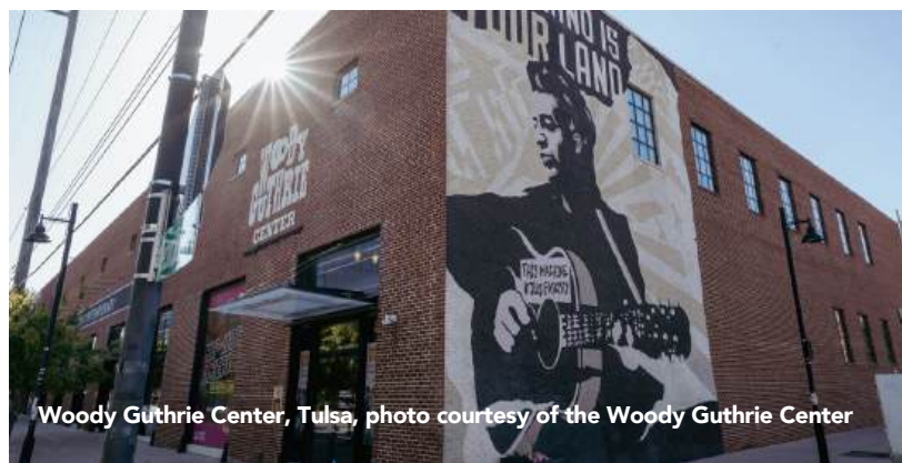
Woody Guthrie Center, Tulsa

DISCLAIMER: The itinerary is subject to change at the discretion of the Virginia Museum of Fine Arts and Arrangements Abroad. For complete details, please carefully read the terms and conditions at www.arrangementsabroad.com/terms .