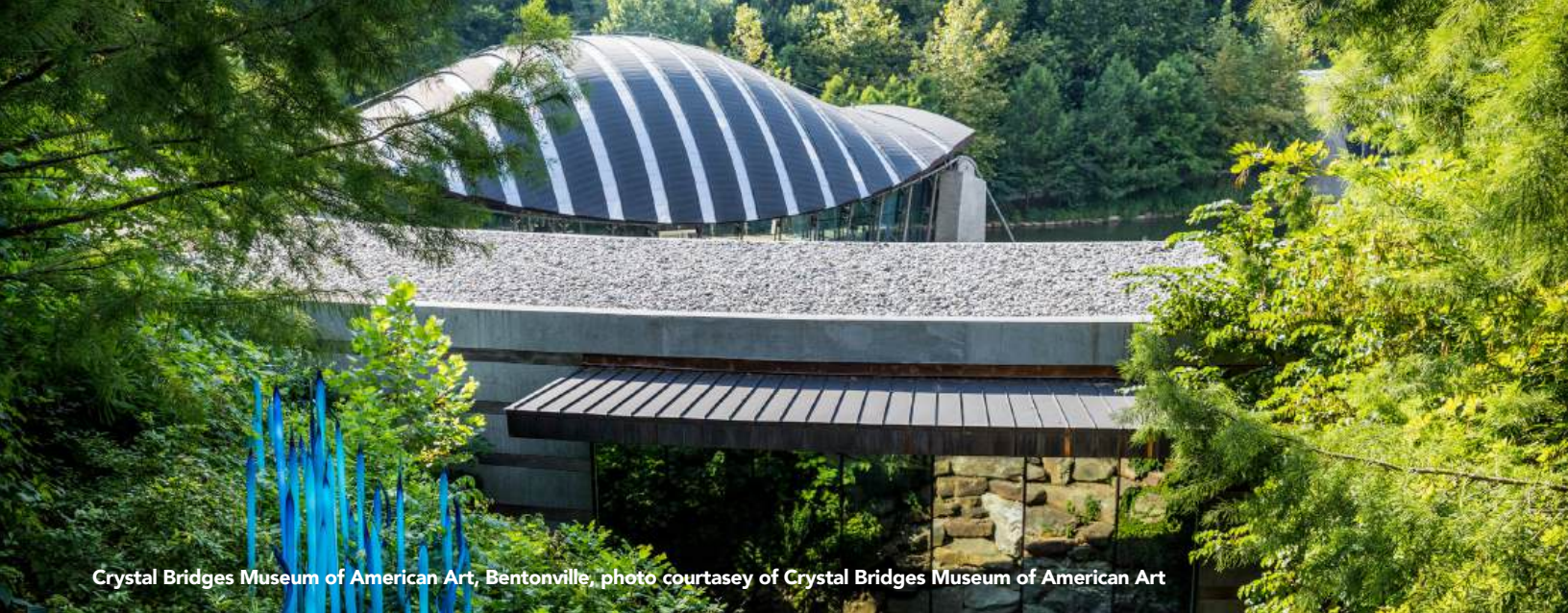
Crystal Bridges Museum of American Art, Bentonville