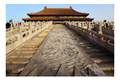
Three Great Halls Palace. Forbidden City in Beijing, China.

This landmark exhibition features more than 180 works of art from the collection of the Palace Museum, Beijing ("The Forbidden City"). The largest art museum in China and the largest palace in the world, it is located in the center of Beijing within the ancient Imperial Palace, where 24 emperors of the Ming and Qing dynasties resided from 1420 until 1924, when the last emperor was expelled. The Palace Museum was established in 1925 and holds more than 1.8 million works of art and artifacts. The exhibition is