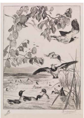
Félix Bracquemond (French, 1833–1914), Lapwings and Teals (Vanneaux et Sarcelles), 1862, etching, plate: 13¾"H × 9% W; image: 10 5/16"H × 7 11/16"W. Gift of Frank Raysor

French printmaker and designer Félix Bracquemond (1833–1914) produced more than 800 etchings during a prolific career that spanned the late 19<sup>th</sup> century. Though celebrated from the outset of his career as a skilled reproductive etcher, Bracquemond enthusiastically championed the etching revival in France, prominently leading the charge toward redefining etching as a highly original art form. Despite his lived status as a luminary within Paris Salon and avant-garde artistic circles, including the Impressionists, Bracquemond is little known today. Félix Bracquemond: Impressionist Innovator re-introduces Bracquemond as an independently-minded, ever-industrious artist through a selection of more than 80 works on paper and tableware objects, among them his most imaginative portraits, landscapes, and groundbreaking reinterpretations of the traditions of French art and decorative arts. The