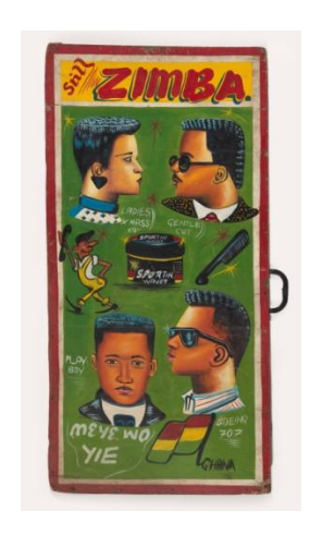
Barber's Sign, ca. 1957, unidentified artist, Ghana, paint on wood panel, 473/4 x 24 in. Gift of Kenneth and Bonnie Brown

Two recently acquired works in the African collection provide insight into far-reaching social and economic changes associated with the independence movement that swept across Africa during the 1950s and 1960s, bringing an end to European colonialism officially, if not in reality. The upbeat Barber's Sign from Ghana, infused with the optimism of the new era, suggests modern hairstyles for fashionable personal identity, while celebrating the name Ghana along with the red, yellow, green, and black state colors the new nation adopted after declaring autonomy from Britain in 1957. Revealing another aspect of the transition, the haunting photo montage, Untitled 21 , from the suite Mémoire , by Congolese artist, Sammy Baloji investigates the impact of industrial development in the Belgian Congo during the colonial era and its demise after independence in 1960. In this