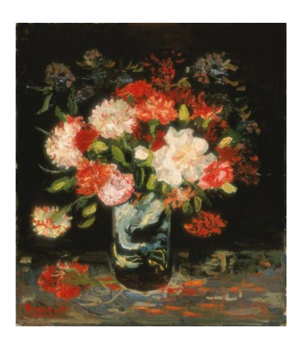
Vincent Van Gogh (Dutch, 1853–1890) Vase with Carnations, summer 1886, oil on canvas, 181/8 x 143/4 in. Collection Stedelijk Museum, Amsterdam, purchased with the generous support of the Vereniging van Hadendaagse Kunstaankopen, A2235