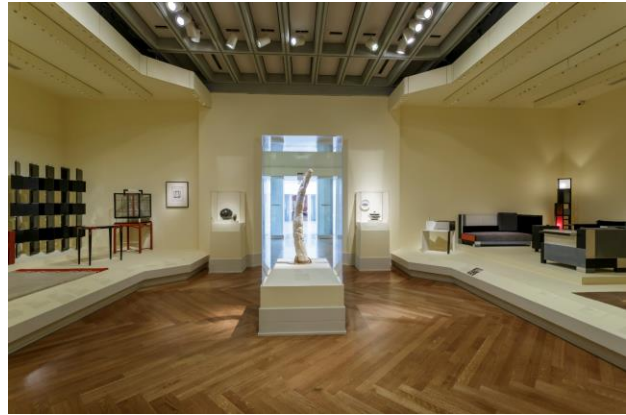
The Lewis Collection Art Deco and Art Nouveau Galleries at the Virginia Museum of Fine Arts.

Currently VMFA, one of the top ten comprehensive art museums in the U.S., comprises 718,831 square feet. The newly planned McGlothlin Wing II will comprise approximately 173,000 square feet of new gallery spaces for American and Indigenous American art (approximately 30,000 square feet), contemporary art (approximately 12,400 square feet), African art (approximately 8,600 square feet) and a special exhibition gallery suite (approximately 12,000 square feet). The new wing also will include a special events space that will seat 500 people, meeting rooms, and a café and bar.