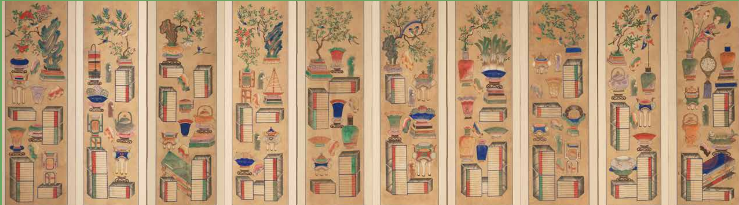
Books and Scholar's Objects (detail), late 19th century, Korean, Joseon dynasty, ten-panel folding screen: ink and color on silk, entire screen: 73 1/4 × 174 3/4 in., Kathleen Boone Samuels Memorial Fund

VMFA offers traditional lecture-style classes as well as one- or two-part introductory courses that include exploration in the best classroom available—the VMFA galleries! Visit VMFA.museum/adults for a complete list of programs.