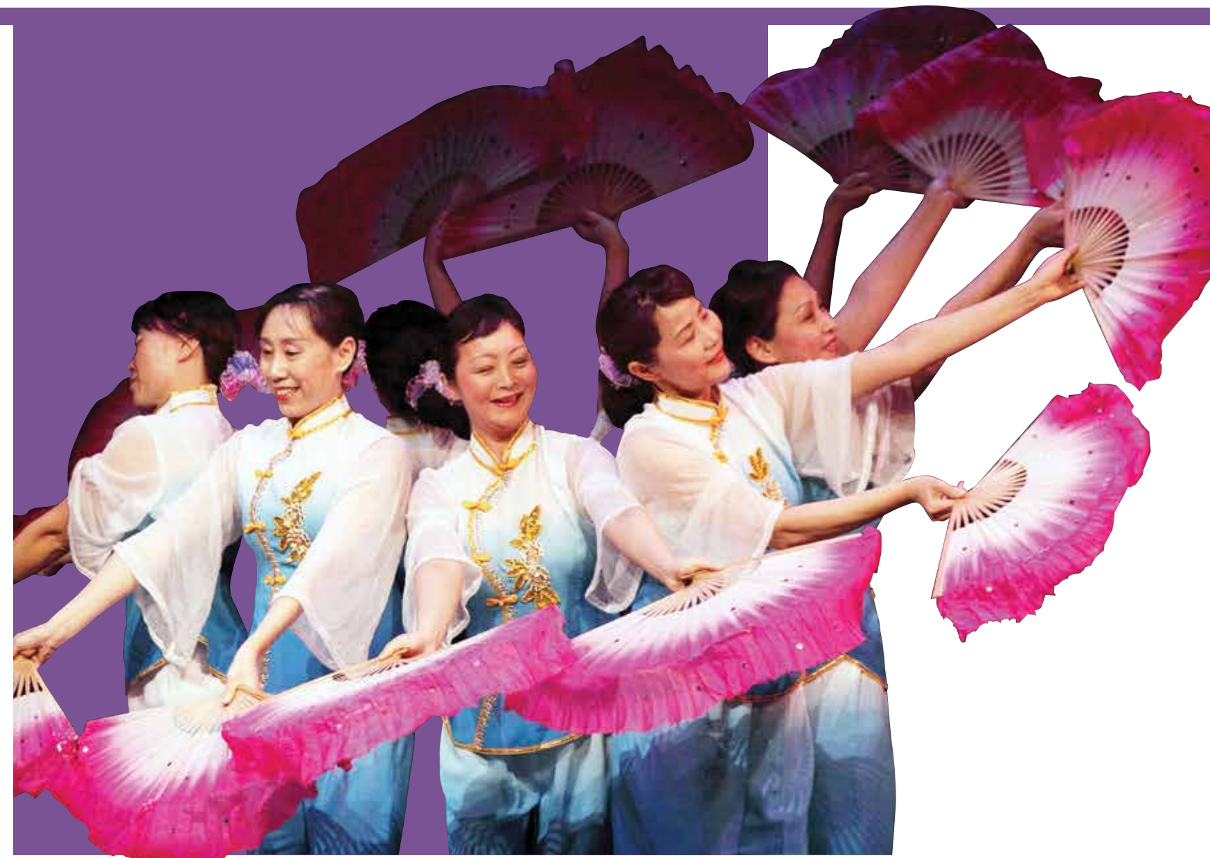
© 2015 Virginia Museum of Fine Arts Nov (7607-161)

Join us and celebrate the opening of the special exhibition Kehinde Wiley: A New Republic . Through art activities, demonstrations, and participatory performances, celebrate and discover African and African American art and cultural identities.