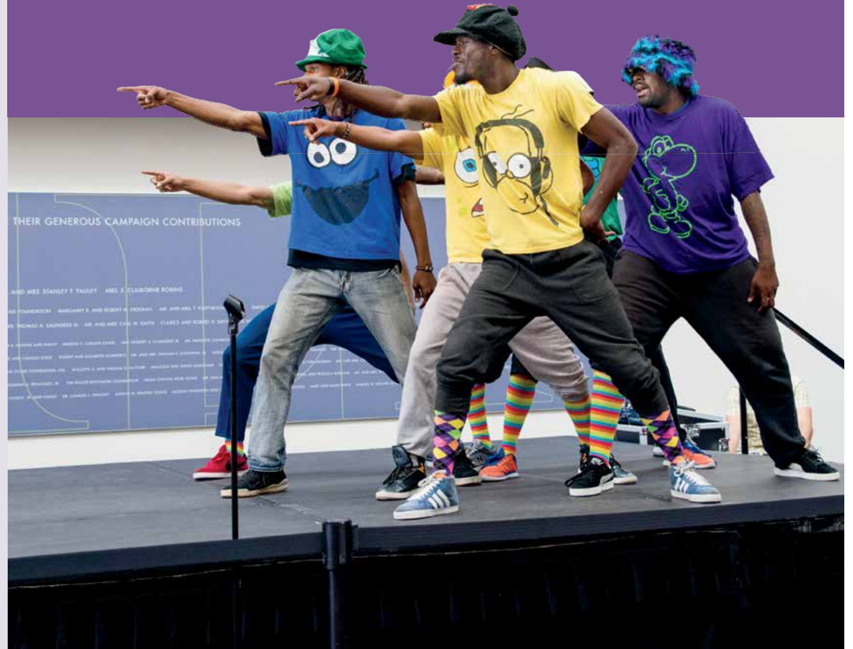
© 2016 Virginia Museum of Fine Arts Mar (7749-161)

VMFA STAFF AND VOLUNTEERS All ages, children under 13 must be accompanied by an adult First Sundays, 1–4 pm Jun 5, Jul 3, Aug 7 Free, no registration required Take a break from the summer sun and enjoy cool “make-it and take-it” art projects, inspired by a select work of art from our world-renowned collection! A new activity is offered every month, based on availability of materials. For groups of eight children or more, please email youthstudio@vmfa.museum .