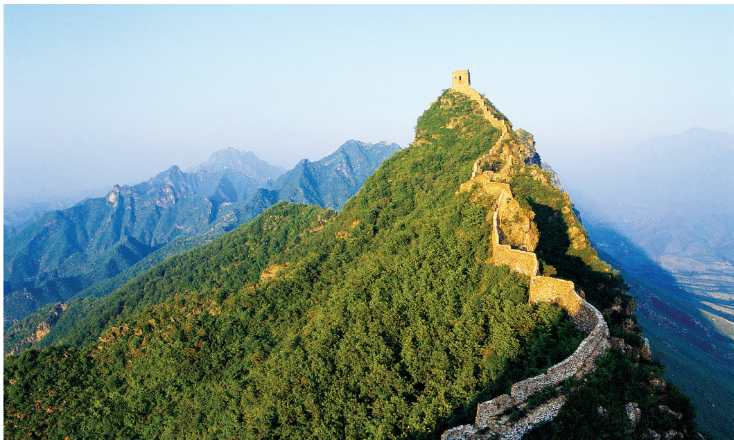
China's Great Wall winds across deserts and grasslands, mountains and plateaus for more than 5,500 miles.

Day 8: Xian This morning we tour the Shanxi Provincial Museum, with an acclaimed collection of historic and cultural artifacts. We eat lunch in a local restaurant then visit a typical farming village where we meet the local people and see their life-style up close. B,L