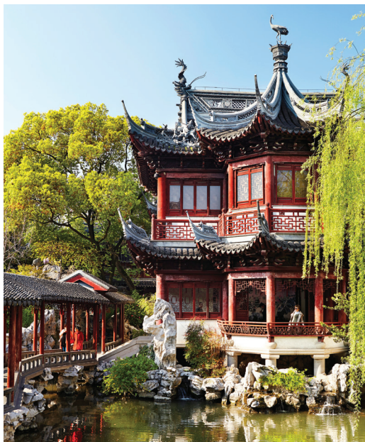
Pagoda in Shanghai's Yu Yuan Gardens