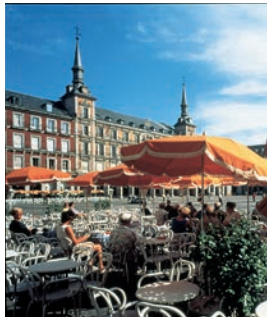
Plaza Mayor in Madrid

Day 13: Madrid Our morning tour of this monumental and dignified capital city includes vast Plaza Mayor, in the heart of Old Madrid; the Moorish medieval district; and opulent 18 th -century Palacio Real (Royal Palace), with its 2,800 rooms. Our tour ends at the