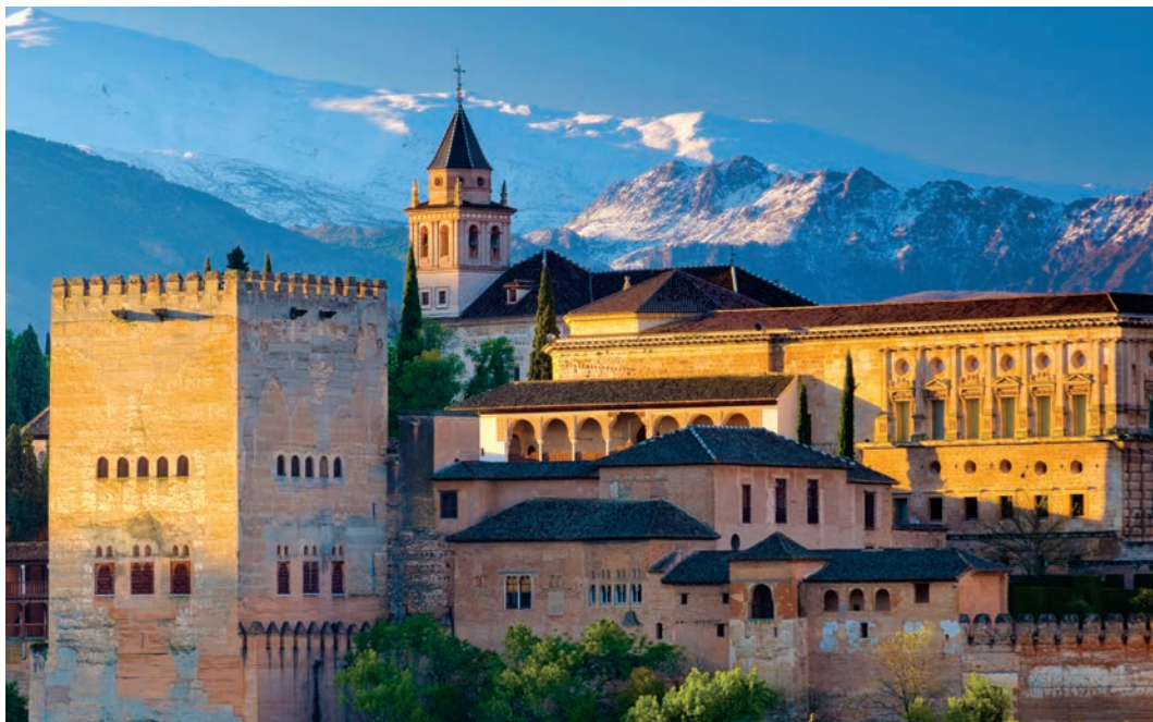
We see Granada's Alhambra, the Moor's "pearl set in emeralds," on Day 11.

Day 7: Carmona/Seville This morning we visit splendid Seville, Moorish capital of Spain's Andalusia region and city of beauty and romance. This is the place that inspired Carmen and Don Giovanni ; where fragrant orange trees and flower-bedecked balconies delight the senses; and home of the renowned Catédral, the world's largest Gothic building. After a tour that includes the palace and the Arab quarter, the afternoon is free to explore independently. We return to Carmona late afternoon and dine at our parador this evening. B,D