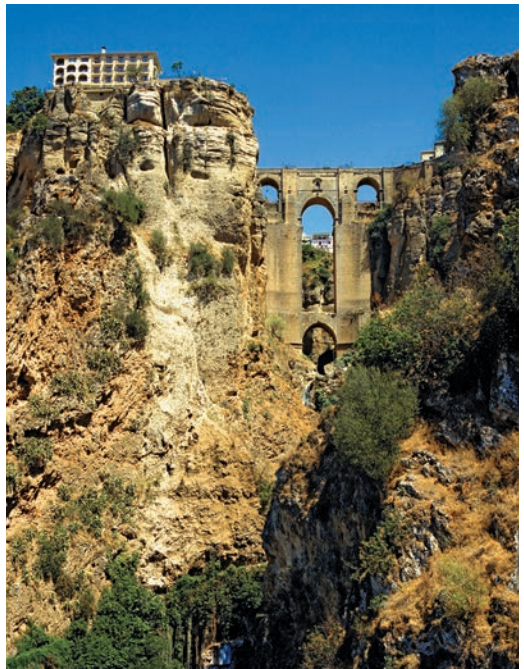
Parador de Ronda atop El Tajo Gorge

Day 12: Ubeda/Toledo/Madrid A highlight is in store today as we visit Toledo, capital of medieval Spain. Declared a Spanish National Landmark, the city is little changed visually from its 16 th -century days as a subject for the artist El Greco. Toledo boasts an incomparable hilltop setting overlooking the Castilian plains and surrounded on three sides by the Tagus River. After lunch on our own we see Toledo’s most important sights on our guided tour, including the massive Gothic Cathedral begun in 1226 and not finished until 1493. Then we continue on to Madrid, arriving late afternoon. Dinner tonight is on our own; perhaps to dine late as the Madrileños do. B