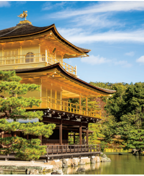
We visit Kyoto’s beloved Golden Pavilion on Day 10.

Day 10: Kyoto We depart this morning by train for Kyoto, formerly Japan’s Imperial Capital and now the country’s cultural and artistic center, with more than 1,600 temples, hundreds of shrines, artful gardens, and historic architecture. Upon arrival, we visit Kinkaku-ji, the beloved lakeside Temple of the Golden Pavilion set on pillars suspended over the water. Next: Ryoan-ji, a Zen Buddhist temple whose acclaimed dry garden epitomizes the simplicity of Zen meditation. Our last stop is Unrakugama, a workshop specializing in prized Kiyomizu pottery. B,D