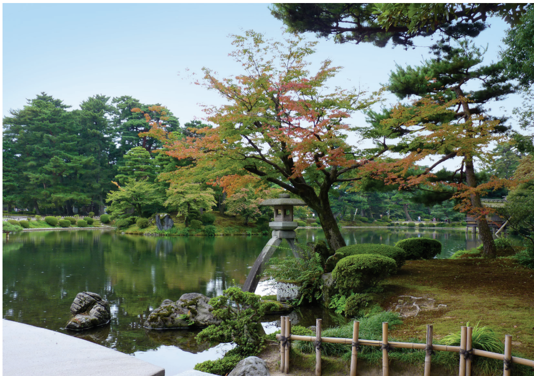
On Day 9 we visit Kenrokuen Garden, one of Japan's finest traditional gardens.

Day 6: Hakone/Takayama Today we travel first by bullet train then by Wide View Hida express train to lovely Takayama in the Japanese Alps, considered one of the country's most attractive towns with its 16 th -century castle and old-style buildings. Our explorations center on three narrow streets in the San-machi-suji district where, in feudal times, merchants lived amidst the authentically preserved small inns, teahouses, and sake breweries. This afternoon we attend a traditional Japanese tea ceremony here, an historic ritual of form, grace, and spirituality. B,D