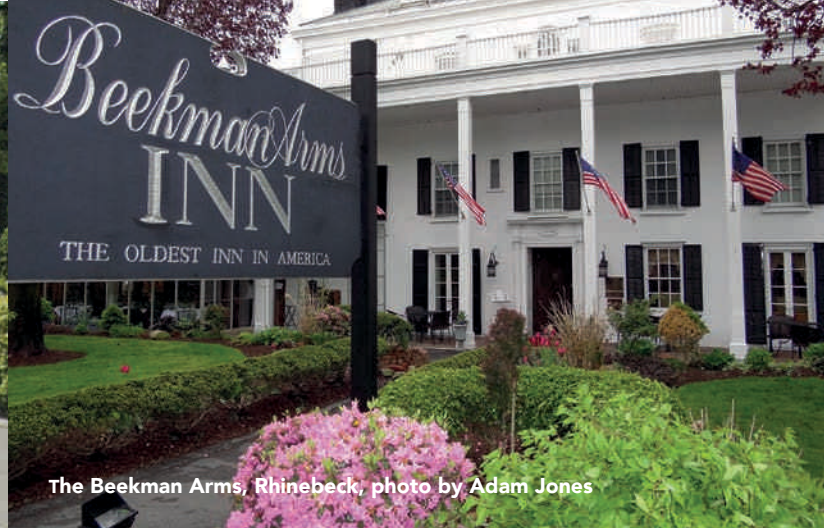
The Beekman Arms, Rhinebeck

and admire the extensive art collections and beautiful gardens overlooking the Hudson River. Also visit the Union Church of Pocantico Hills adorned with windows designed by Matisse and Chagall and commissioned by the Rockefellers in the 1950s and 1960s. Our farewell dinner is at the Culinary Institute of America, which has set the standard for excellence in professional culinary education for over six decades. B, L, D