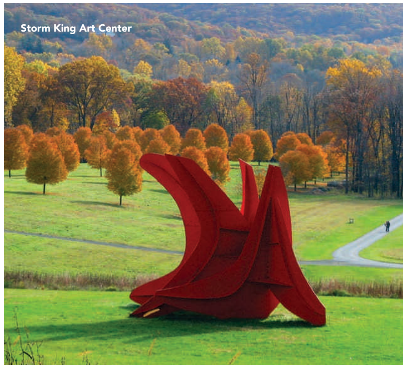
Storm King Art Center

This morning visit Dia:Beacon, the contemporary art museum with works of art from the 1960's to the present. After lunch, spend time at Kykuit, the stunning hilltop home to four generations of the Rockefeller family,