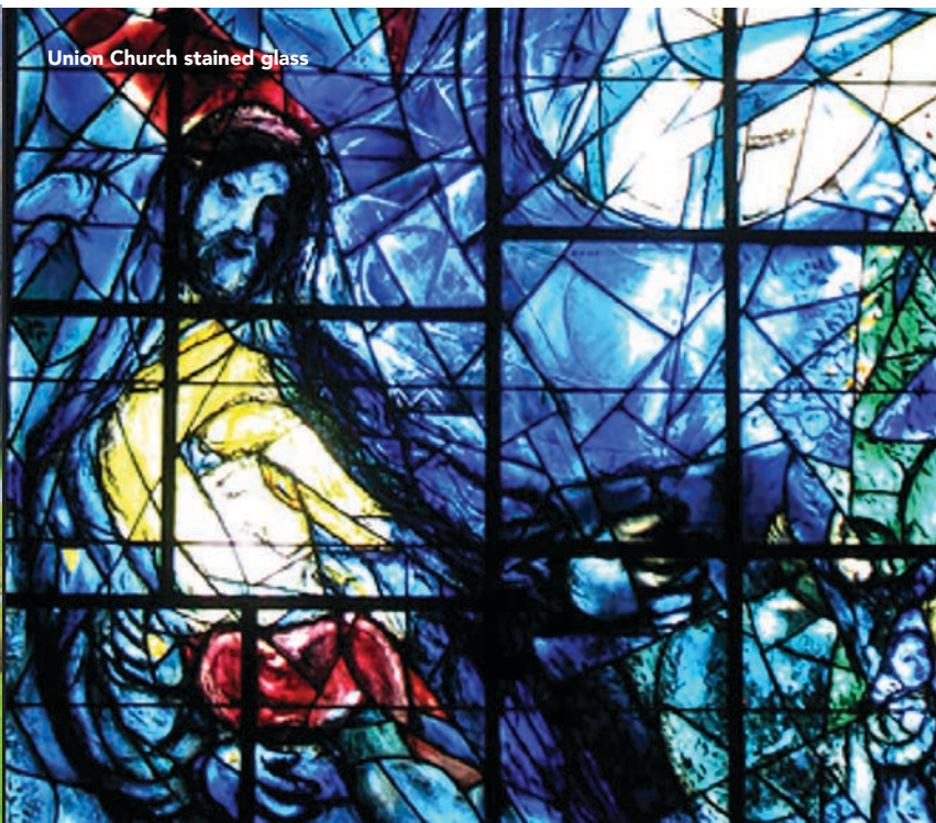
Union Church stained glass

DISCLAIMER: The itinerary is subject to change at the discretion of Virginia Museum of Fine Arts and Arrangements Abroad. For complete details, please carefully read the terms and conditions at www.arrangementsabroad.com/terms