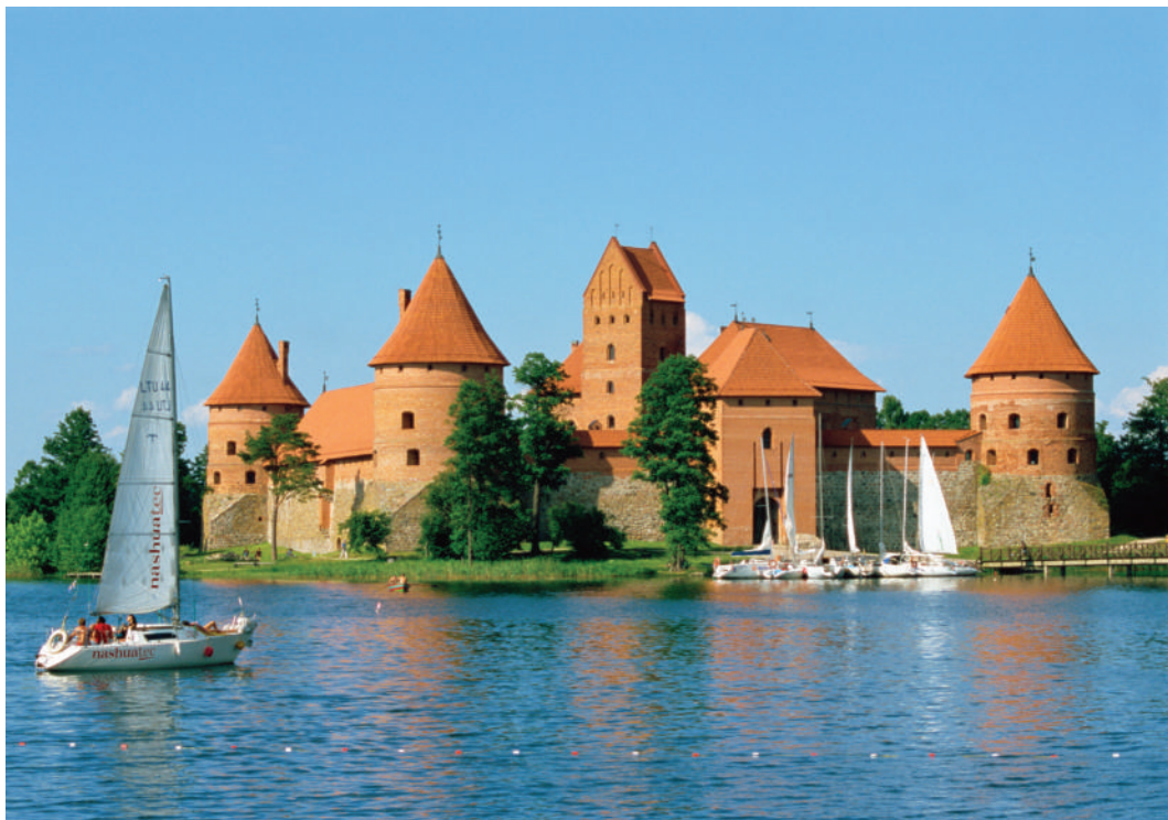
We visit beautiful 15 th -century Trakai Castle on Day 4.

Baltic capitals. Riga boasts lovingly restored architecture ranging from medieval to art nouveau; a well-preserved Old Town; magnificent churches, including St. Mary's Cathedral (the Dom), with its 6,789-pipe organ; and a lively arts scene. The afternoon is free; our well-located hotel offers easy access to Riga's attractions. B