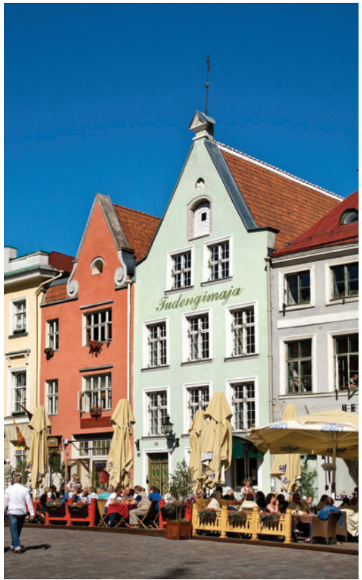
Tallinn's historic and lively Town Hall Square

Peterhof This morning we travel to Peterhof, one of the many royal “summer” palaces built by the Romanovs during the last two centuries of their rule. Most of these palaces were virtually destroyed by retreating Germans during World War II and