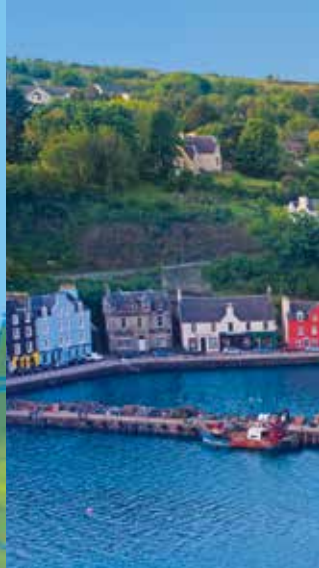
Brightly painted houses overlook

See Milestone 0, which marks the Road to Freedom's commencement.