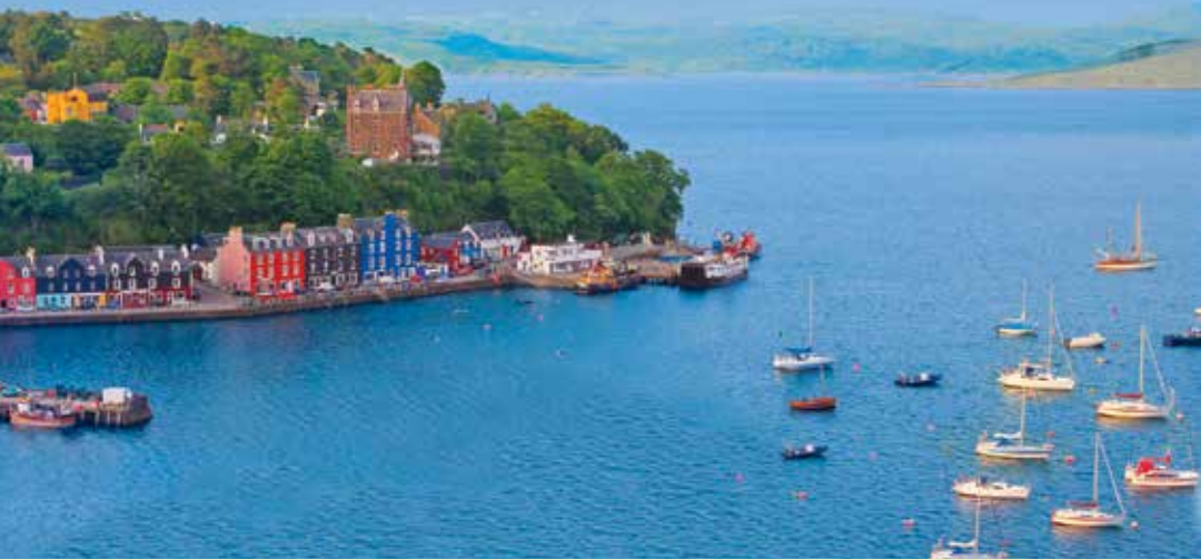
the sheltered sound in the colorful fishing port of Tobermory, capital of the Isle of Mull.

fortress built by Edward I of England as a defense against the marauding Welsh. Following the tradition of seven centuries of monarchs, Queen Elizabeth II invested the future heir to the British throne, her son Charles, as Prince of Wales at Caernarfon in 1969.