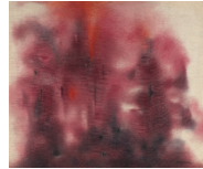
Norman Lewis Roseate Mist 1952