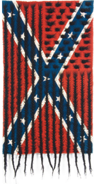
Sonya Clark Black Hair Flag 2010