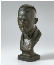
Richmond Barthé* Booker T. Washington 1928