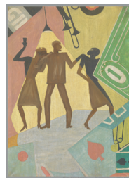
Aaron Douglas The Prodigal Son ca. 1927