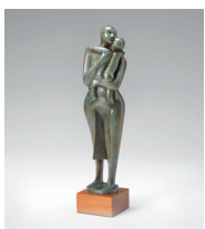
Elizabeth Catlett Standing Mother and Child 1978