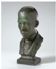
Richmond Barthé* Paul Laurence Dunbar 1928