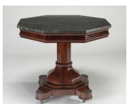
Thomas Day* Center Table ca. 1850s