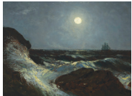
Edward Mitchell Bannister* Moonlight Marine 1885