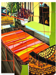
Mickalene Thomas Interior: Two Chairs and Fireplace 2011