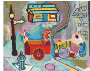
Beauford Delaney* Greene Street 1946