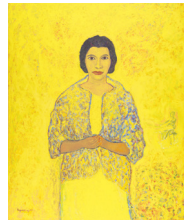
Beauford Delaney* Marian Anderson 1965