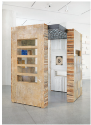
Theaster Gates Glass Pavilion 2011