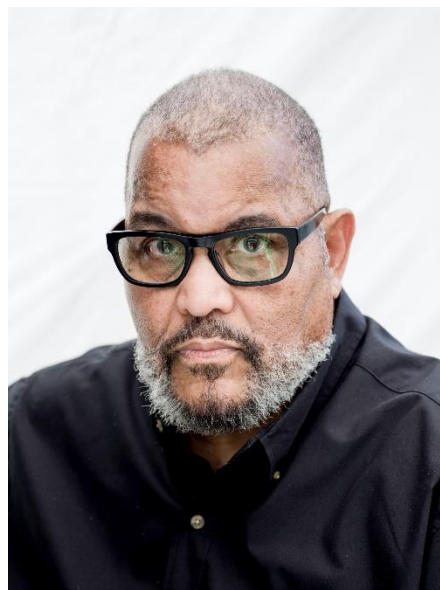
Dawoud Bey.

Celebrated for his rich, psychologically compelling portraits, Dawoud Bey was born in Queens, New York in 1953. Highly regarded as an educator as well as a photographer, Bey's work has been defined by the empathy he brings to his subjects and the complexity with which he depicts them. Renowned for his early street photography and deeply probing portraits, the artist's recent bodies of work focus on the construction of history and memory.