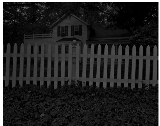
Untitled #1 (Picket Fence and Farmhouse) from the series Night Coming Tenderly, Black , 2017, Dawoud Bey (American, born 1953), gelatin silver print. Rennie Collection, Vancouver