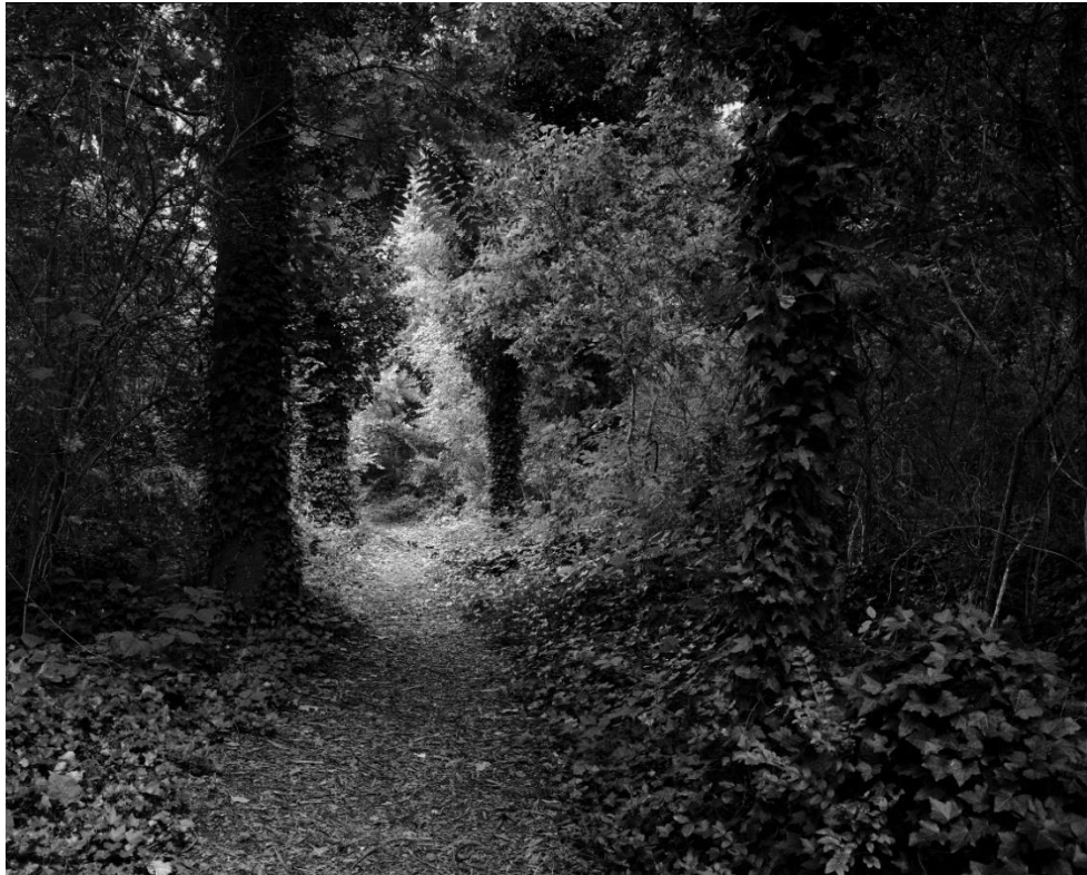
Untitled (Trail and Trees) from the series Stony the Road , 2022, Dawoud Bey (American, born 1953), gelatin silver print. Virginia Museum of Fine Arts, Gift of Mrs. Alfred duPont, by exchange

Richmond, VA — The Virginia Museum of Fine Arts (VMFA) will present the highly anticipated exhibition Dawoud Bey: Elegy from November 18, 2023, to February 25, 2024. A profound exploration of early experiences of African Americans in the United States, the groundbreaking survey marks the comprehensive exhibition of three photographic series and two film installations by renowned contemporary artist Dawoud Bey (American, born 1953). Elegy will also debut Bey’s newest photographic series, Stony the Road (2023), as well as the artist’s latest film, 350,000 (2023), both created in Richmond.