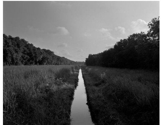
Irrigation Ditch from the series In This Here Place , 2019, Dawoud Bey (American, born 1953), gelatin silver print. Rennie Collection, Vancouver

"These histories are no longer visible," explained Bey. "We, in fact, cannot photograph or make cinematic work about this history. My work deals with trying to reimagine the sites of this history. I apply a set of conceptual, formal, optical and material strategies to the visualization of these spaces that activate the imagination around these particular landscapes that still have deep meaning. This act of radical reimagining allows the viewer to momentarily let go of the fact that you're looking at a photograph or a film. You can be so deeply drawn into the experience that a film or a photograph is describing — you begin to inhabit it in a way — that it seeps into your consciousness."