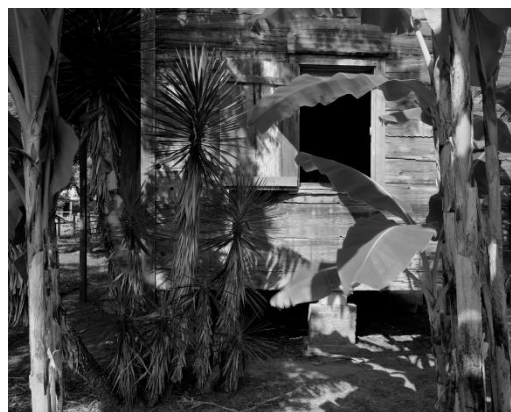
Cabin and Palm Trees from the series In This Here Place , 2019, Dawoud Bey (American, born 1953), gelatin silver print. Rennie Collection, Vancouver