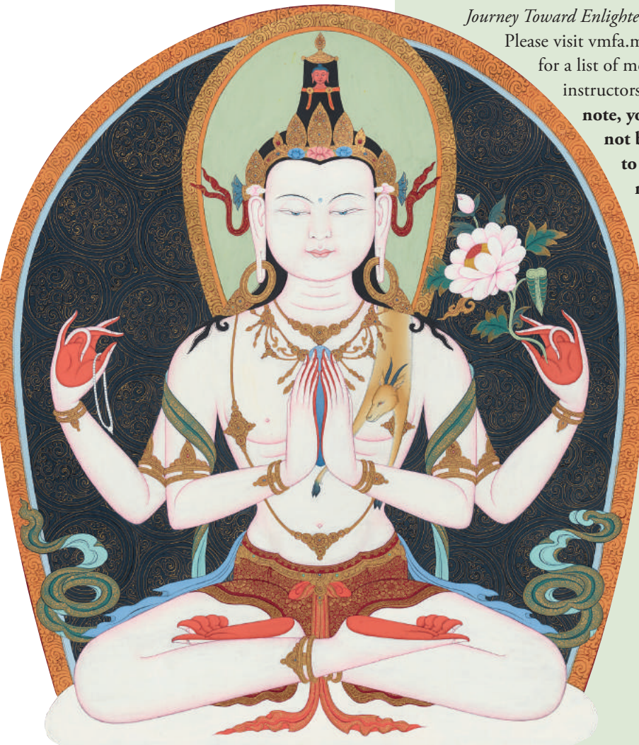
IMAGE The Three Protectors of Tibet (detail), 2008, Tsherin Sherpa (Nepalese, born 1968), ink and colors on cotton. Asian Art Museum of San Francisco, acquisition made possible by the Tibetan Study Group, 2016.305

Sat Aug 3 | 11 am–noon Special Exhibition entrance Free, no tickets required At the opening of the Awaken exhibition, Tibetan Buddhist monks from Drepung Loseling Monastery in southern India constructed a sand mandala. The monks will dismantle the mandala, in a closing ceremony, sweeping up the colored sands to symbolize the impermanence of all that exists.