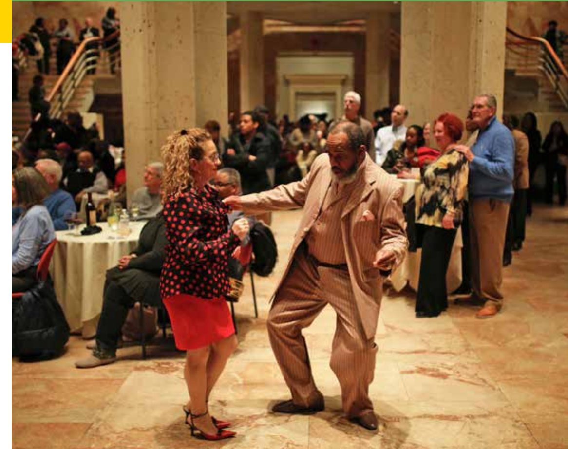
© 2020 Virginia Museum of Fine Arts Jul (00316) Photo credits: Cover and page 17 by Travis Fullerton Page 3 by VMFA Staff Back cover, pages 4, 9, 10 top, 10 bottom, 12, 13, 15, 18, 18–19, 19 by David Stover Page 23 by Jay Paul