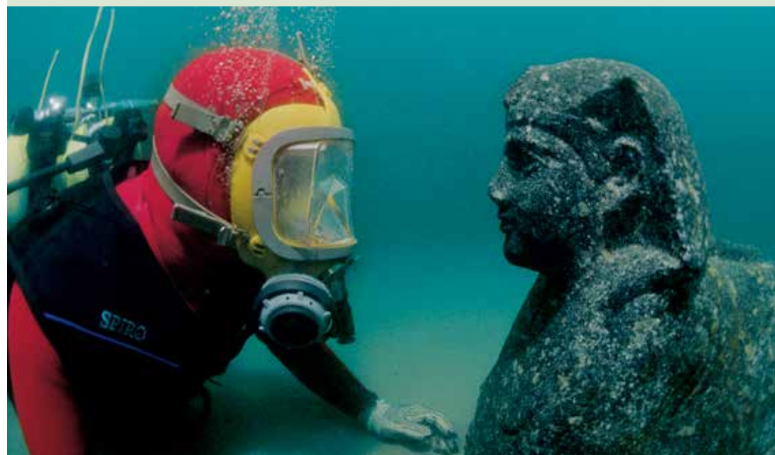
IMAGE Treasures of Ancient Egypt: Sunken Cities is organized by the European Institute for Underwater Archaeology with the generous support of the Hilti Foundation and in collaboration with the Ministry of Antiquities of the Arab Republic of Egypt. The exhibition program at VMFA is supported by the Julia Louise Reynolds Fund.