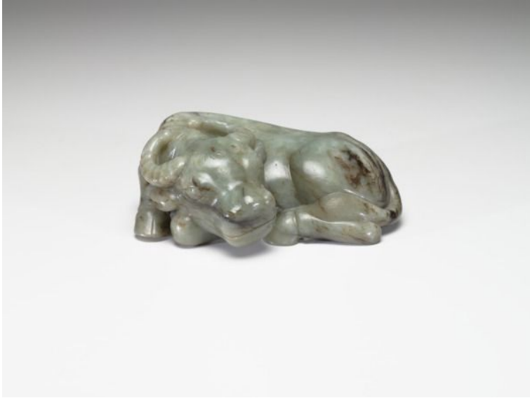
Reclining Ox , 19th century Unknown Artist Chinese, Qing dynasty Nephrite (jade) East Asian Gallery, VMFA 2003.76