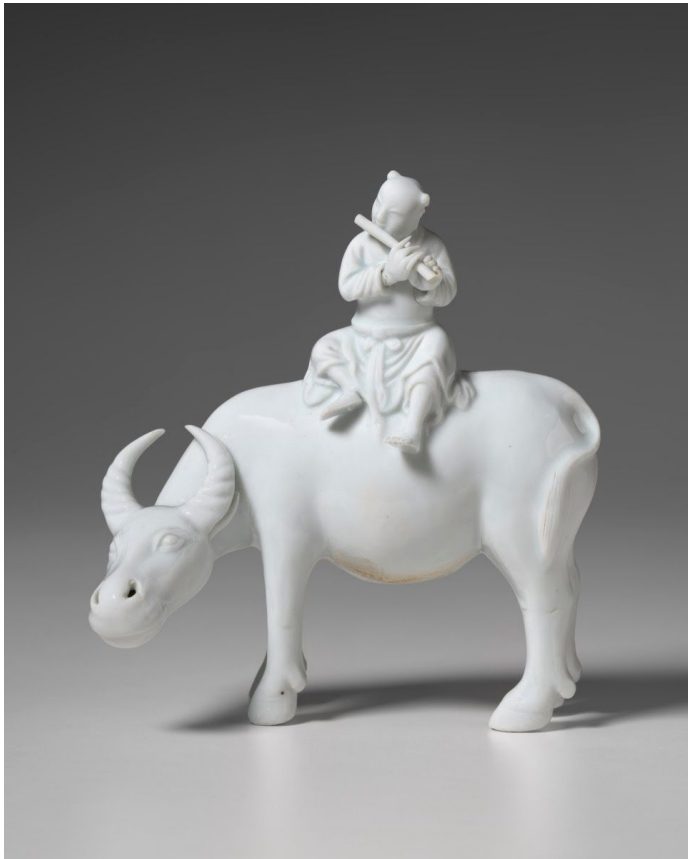
Boy Playing Flute on Ox , 20th century Unknown Artist Chinese, Qing dynasty Dehua Ware - Porcelain East Asian Gallery, VMFA 85.1487