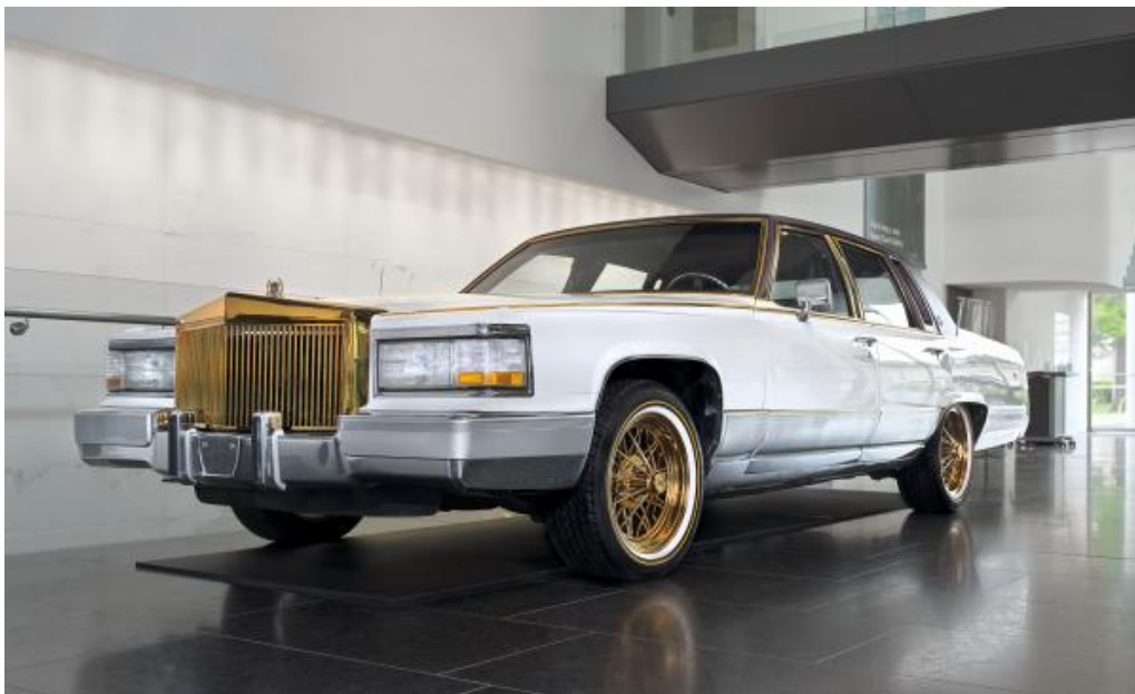
Richard FIEND Jones (a.k.a. International Jones), (American, b.1976), SLAB , 2021, 1990 Cadillac Brougham d'Elegance with custom accessories, Virginia Museum of Fine Arts purchase