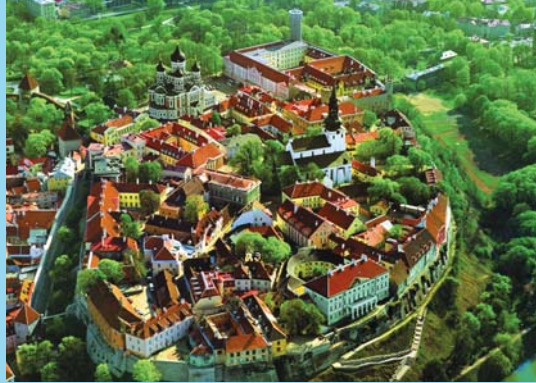
Tallinn, a hub of culture and commerce, retains its history in its 600-year-old spires and gables.

Grand Palace. By hydrofoil, skim over the Gulf of Finland to return to St. Petersburg.