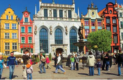
Stroll through Gdańsk's Old Town, rebuilt and restored after World War II in pre-19 th -century architectural styles.