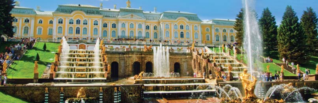
Admire the fountains and statues of the Grand Cascade at Petrodvorets, Peter the Great's summer palace.

the Rock,” impressively hewn out of natural bedrock, and visit Sibelius Park, where Eila Hiltunen’s remarkable sculpture honors Finland’s most beloved composer, Jean Sibelius. Then, enjoy a private concert in the prestigious Sibelius Academy.