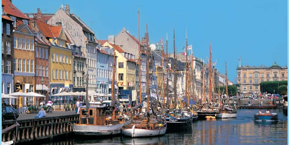
The Vikings' legacy and the maritime character of a traditional Hanseatic city are showcased along Copenhagen's Nyhavn Waterfront.

Grand Palace. By hydrofoil, skim over the Gulf of Finland to return to St. Petersburg.