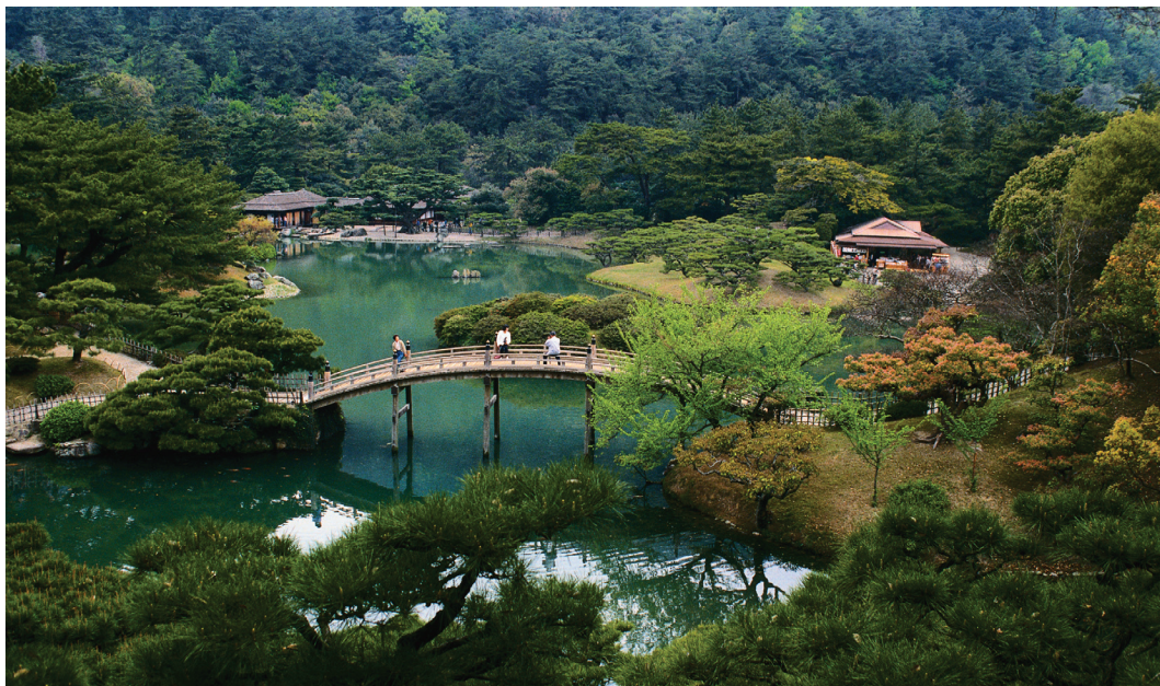
Japan is well-known for its beautiful gardens.

breathhtaking panoramic views; then we descend for a relaxing cruise on scenic Ashi Lake. Leaving the park, we travel to the town of Suwa where we spend the night at a ryokan , a traditional Japanese inn where we take off our shoes upon entering and sleep on a futon. B,D