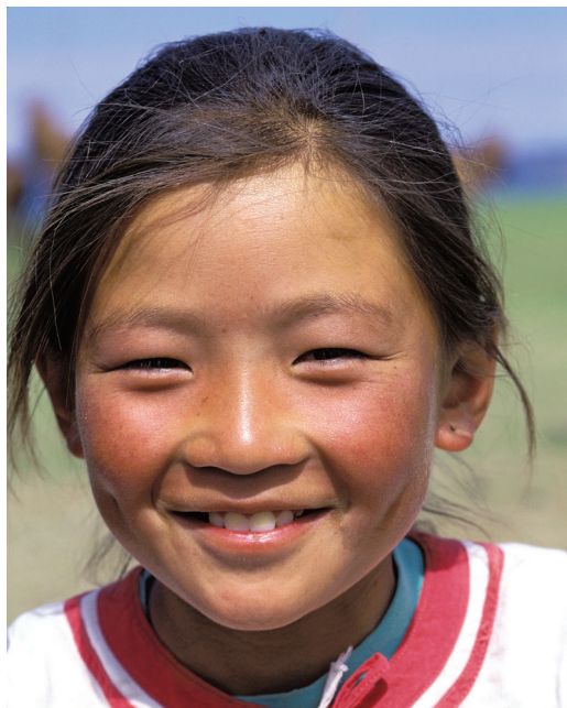
Young Mongolian girl

Day 16: Arrive U.S. We arrive in the U.S. today and connect with our flights home.