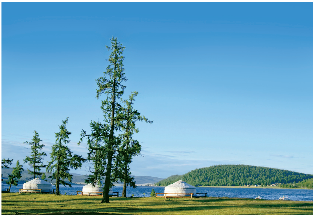
Pristine Lake Khuvsgul, where we spend two nights

Day 5: Gobi Desert/Khongoryn Els Like Mongolia’s nomads, we travel through the desert today along the Altai Mountain range to Khongoryn Els, home of the “singing” sand dunes. Stop en route to visit with a local camel breeder’s family. B,L,D