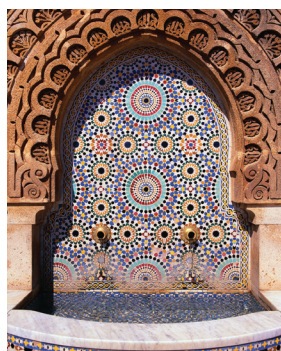
Traditional Moroccan tile work

Day 11: Marrakech Once the capital of southern Morocco, the imperial city of Marrakech is an alluring oasis with a temperate climate, distinct charm, and fascinating sights. A day-long tour includes the beautifully proportioned Koutoubia Mosque with its distinctive 282-foot minaret visible from miles away; the beautiful Andalusian-style El Bahia Palace and the ruins of the 16 th -century Palais El Badii. After lunch at the hotel, embark mid-afternoon on a walking tour of the medina , ending at Djemaa el Fna Square, a UNESCO site and the