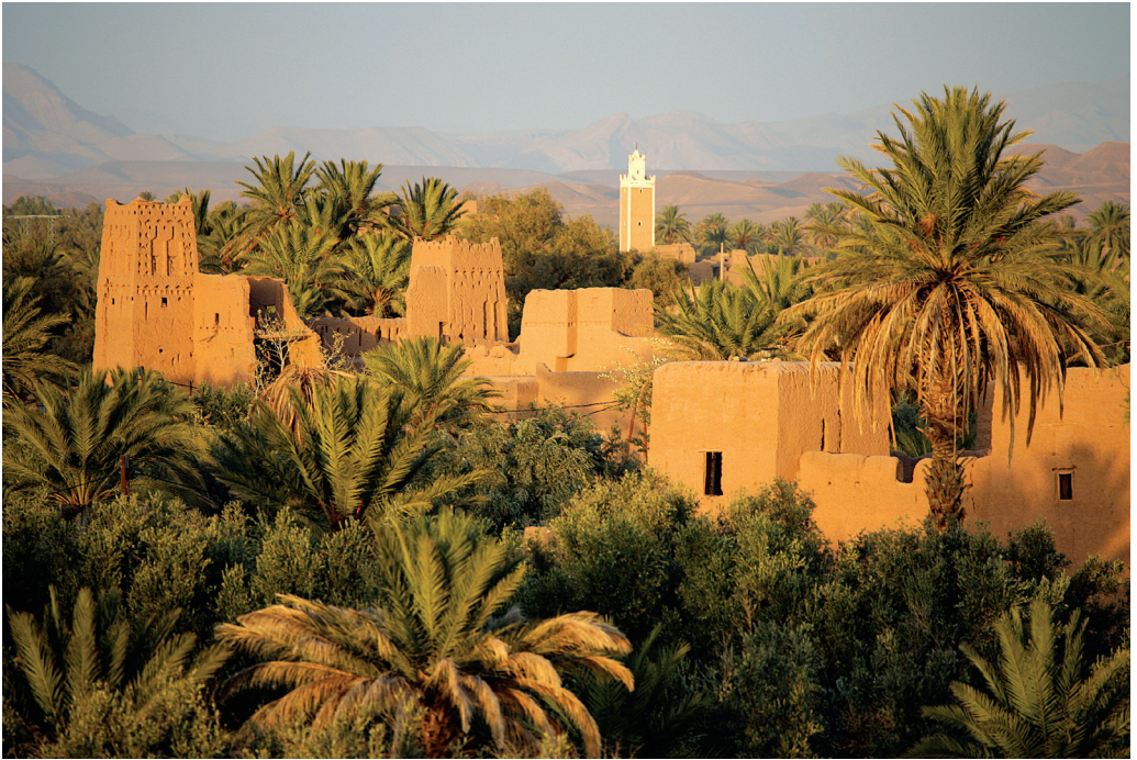
Traveling the “Route of a Thousand Kasbahs,” see many of the traditional fortresses that protected cities from attack.

site, focusing on the artisans’ quarters, the 14 th -century Koranic schools, and Al Karaouine, the medieval theological university. Return to the hotel for lunch and some time at leisure. Mid-afternoon tour the old mellah (Jewish quarter) and its 17 th -century synagogue, the royal gates, and the Museum of Fez. Tonight enjoy dinner together at an intimate family-run riad in Fez. B,L,D