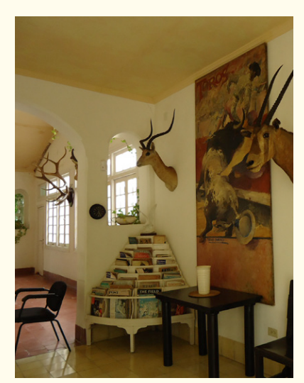
Pharmacy Museum in Matanzas (left), Havana (center), and Finca La Vigía (right)