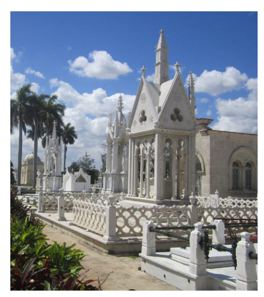
Museo de la Revolución (left), street entertainers (center), and Colón Cemetery (right), Havana