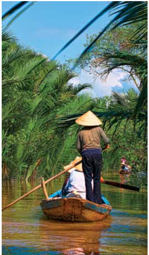
Along the mighty Mekong