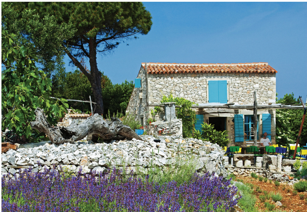
A typical farmhouse we'll see along Croatia's scenic Adriatic Coast

Day 7: Opatija/Istrian Peninsula Today's tour of the Istrian Peninsula reveals the multicultural roots of this alluring spit of land jutting into the Adriatic. At various times a vassal of Venice, the first Austro-Hungarian Empire, Fascist Italy, the Yugoslav Federation, and finally, Croatia, Istra, as it is known, boasts an interesting history, mild Mediterranean climate, lovely scenery, and good wines. Our first stop is in the port of Pula, where we visit the well-preserved remains of a Roman amphitheater (c. 177 CE). Next is Rovinj, a charming old Venetian port where we are free to explore on our own and perhaps enjoy lunch at an outdoor café. After returning to Opatija late this afternoon, we dine together tonight at a local restaurant. B,D