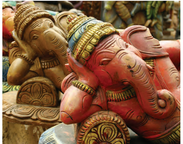
Carved Ganesha in a row

Monday, February 16 Drive to the ancient seaport of Mahabalipuram, famous for its Shore Temple and carved scene depicting Arjuna's Penance. After lunch, drive into downtown Chennai for a visit to the Government Museum. View the collection of South Indian stone sculptures, some dating to the 2nd century B.C.E., and the 10th- to 12th-century Chola Dynasty bronzes of unrivaled quality. Attend a private dance performance before returning to the hotel. Dinner and the evening are at leisure.