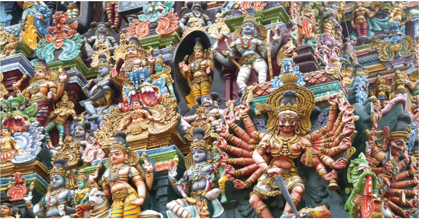
Meenakshi temple detail, Madurai.