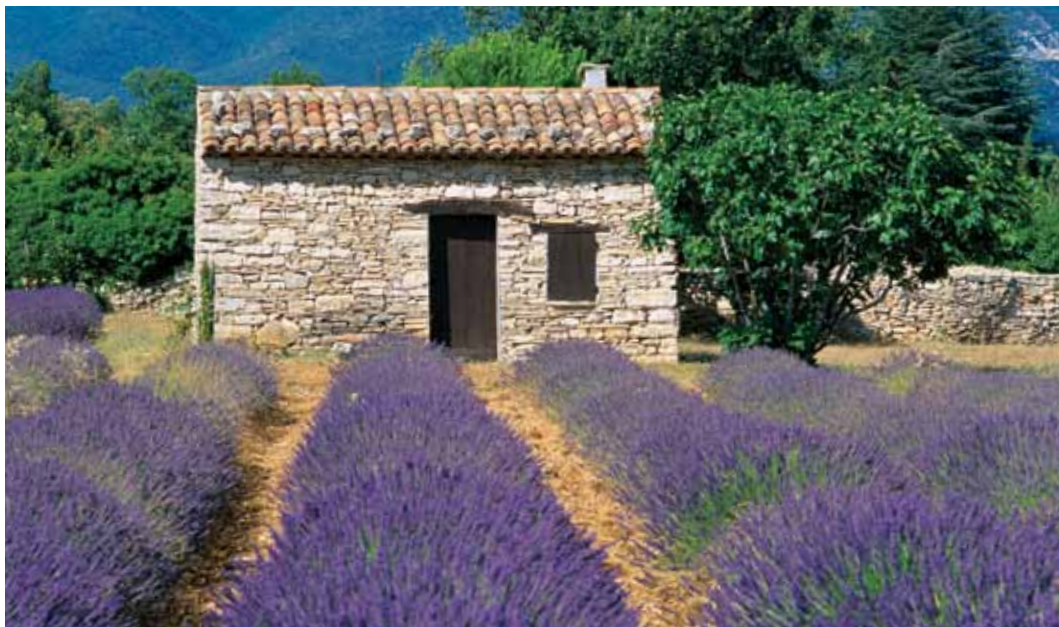
Typical Provençal scene of lavender field and stone building

Day 6: Perpignan This morning we visit Abbaye de Fontfroide, the 11 th -century monastic complex that ranks as the best preserved Cistercian monument in France and a key site in Languedoc. We tour the church and its cloisters then return to our hotel, with the remainder of the day at leisure. B