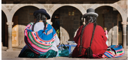
Local Peruvian women in traditional dress