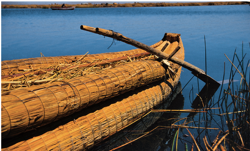
We visit the Floating Island of Los Uros in Lake Titicaca; natives here make their boats from reeds.

for the 1½-hour journey to Aguas Calientes, where after lunch we board a bus for Machu Picchu and our first guided visit of the stunning “Lost City of the Incas.” Thanks to its small size, our group will move nimbly through the ruins and have the leisure to absorb the beauty and mystery of this site whose original purpose has been lost to time. B,L,D