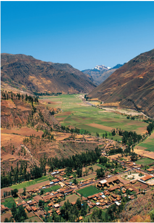
The historic Sacred Valley

clearer, the colors sharper, and the horizon farther. By boat we visit the Floating Island of Los Uros, where the top-hatted Uros people live on "islands" made of the reeds that grow in the lake's shallows; in fact, the Uros rely on these reeds for their boats, the small huts in which they live, household items, and the handcrafts they sell to visitors. We also visit Isla Taquile, known for the high quality textiles crafted by the indigenous people who live here. On our visit, we see the men in their signature woven woolen caps with floppy earpieces, and women in tailored waistcoats and multi-layered skirts. We also witness the breathtaking natural beauty surrounding us, with Bolivia's snow-capped Cordillera range a striking backdrop to the deep blue of Lake Titicaca. Tonight we celebrate our Peruvian adventure at a farewell dinner at our hotel. B,L,D