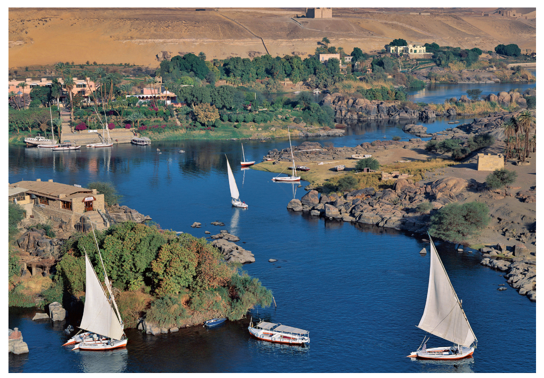
We enjoy an afternoon sail on the Nile on traditional feluccas.

Day 7: Lake Nasser Cruising – Valley of the Lions/Aswan This morning we visit the striking avenue of sphinxes at Wadi el-Seboua's "Valley of the Lions," then cruise to Aswan. B , L , D