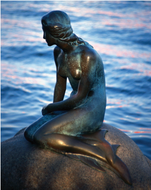
Mermaid statue in Copenhagen

Day 13: Lofthus/Oslo En route to Oslo today, we stop in Eidfjord where we tour the Hardanger Nature Center showcasing the natural and cultural worlds of Norway’s fjord country. Later we stop for photos at mighty Voringfoss Waterfall, considered Norway’s most beautiful cataract. We continue on to Oslo, arriving early this evening. B