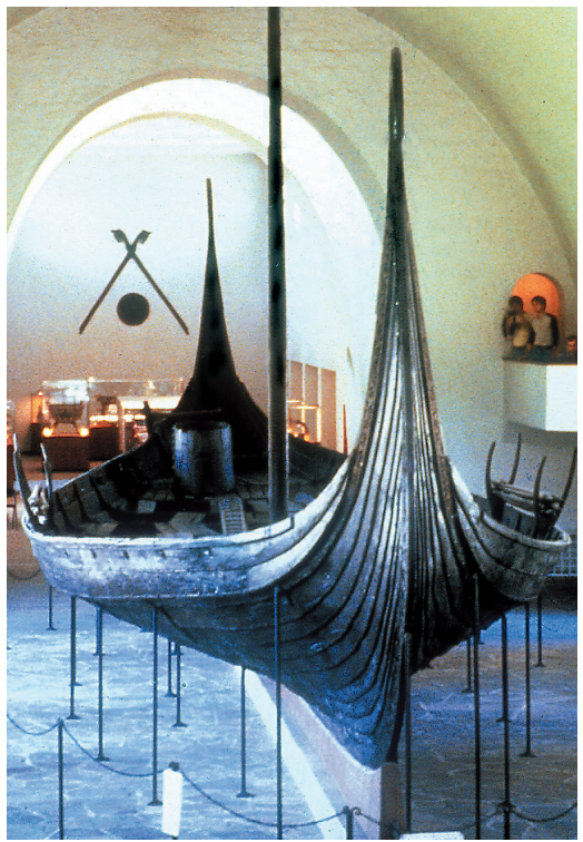
Viking Ship Museum, Oslo

Day 16: Depart for U.S. We transfer to the airport this morning for our return flight to the U.S. B