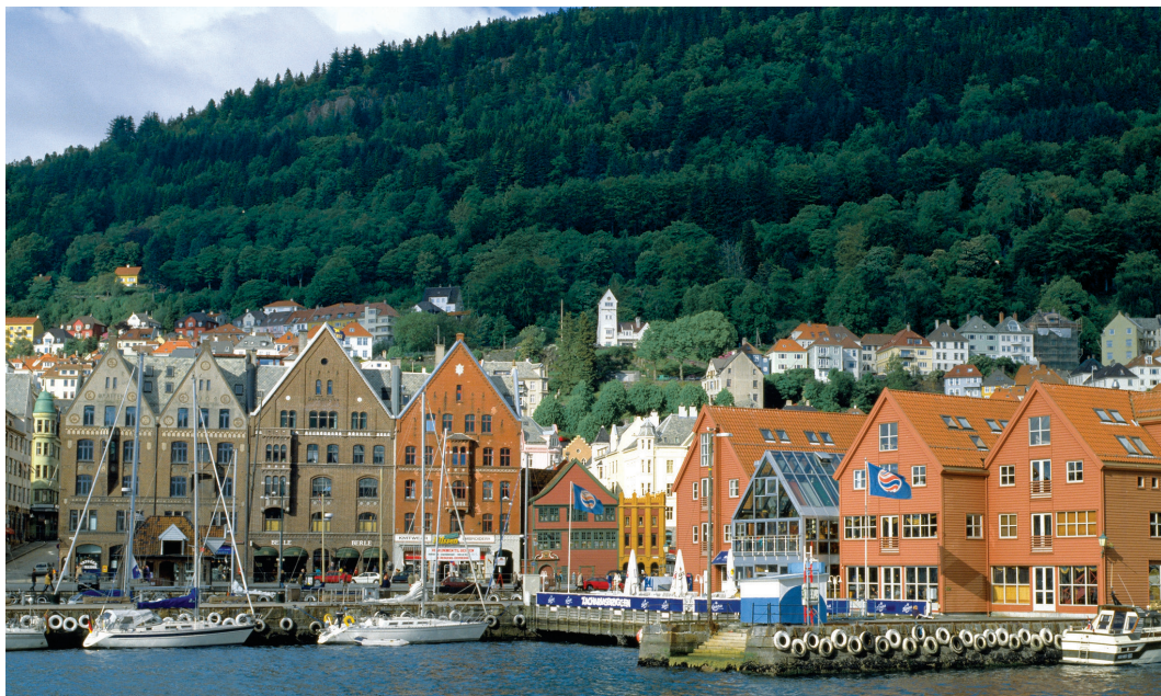
Typical scene of coastal houses in Norway

Day 7: Gaala/Geiranger A day of beautiful scenery is in store as we travel from Gaala to Geiranger, en route negotiating hairpin bends to the summit of Mount Dalsnibba (alt. 4,900 feet) for stunning views of Geirangerfjord and the mountains, lakes, and waterfalls beyond. We reach the popular village of Geiranger mid-afternoon and get our first up-close look at Norway's most dramatic fjord. A UNESCO site, it measures 10 miles long and 960 feet deep. B,D