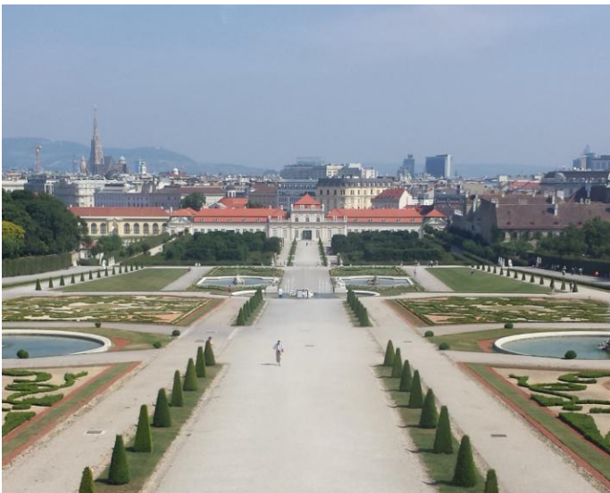
View from the balcony of the Upper Belvedere

Friday, July 22 Transfer to the airport this morning for the return flights home.