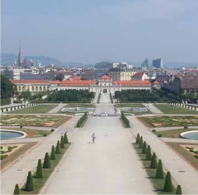
View from the balcony of the Upper Belvedere

Wednesday, July 20 Our day starts with a performance at Spanish Riding School of “Piber Meets Vienna,” a delightful show of mares and their spirited foals. After lunch at leisure in the city, we will take a private guided tour of the City Palace Liechtenstein, the ancestral home of the still-reigning royal family of Liechtenstein, which has been recently restored to its prewar glory. This afternoon, return to the Kunsthistorisches for an opportunity to focus on another section of this magnificent museum. This evening you may wish to dine at one of Vienna’s fine restaurants.