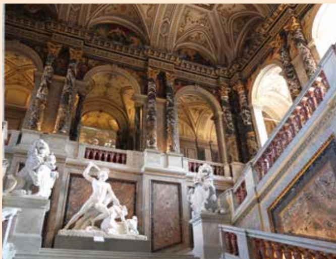
Sacher-Torte, Hotel Sacher. (top); Kunsthistorisches Museum. (above).

Cover: Vienna from St. Stephan's Cathedral.