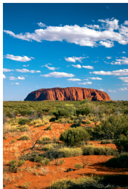
We visit the Aboriginal site of Uluru (Ayers Rock) on Day 8.

Day 19: Queenstown/Rotorua We depart today for Rotorua, with its geysers, bubbling mud pools, hot thermal springs, and a center of Maori culture. Our tour here includes the new Rotorua Museum. B