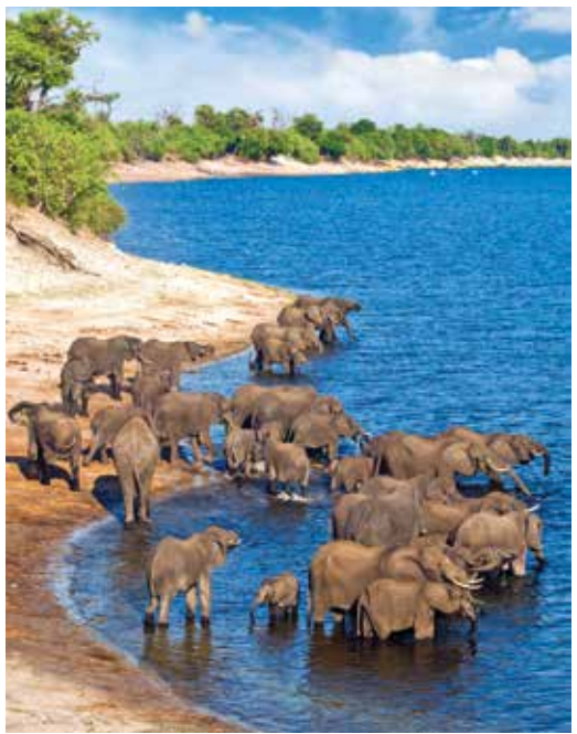
Elephants abound in Chobe.