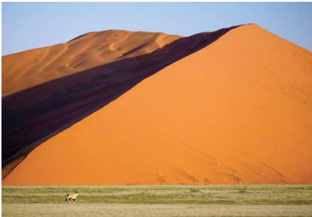
Some of the dunes at Sossusvlei reach as high as 1,300 feet.

exceptional array of wildlife, Chobe National Park in nearby Botswana boasts one of the largest concentrations of wildlife in all Africa, including the world's largest elephant population (some 120,000), as well as zebra, lion, hippo, giraffe, impala, wildebeest, buffalo, and more. We're sure to see some of them on today's full-day excursion to Chobe, where we take a morning wildlife drive and an afternoon wildlife cruise. B,L,D