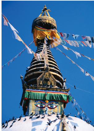
Nepal’s Buddhist Boudhanath stupa.

Today we embark on a highlight of any trip to Bhutan: a visit to Paro Taktsang, the sacred