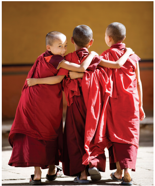
Young monks enjoy some fun.