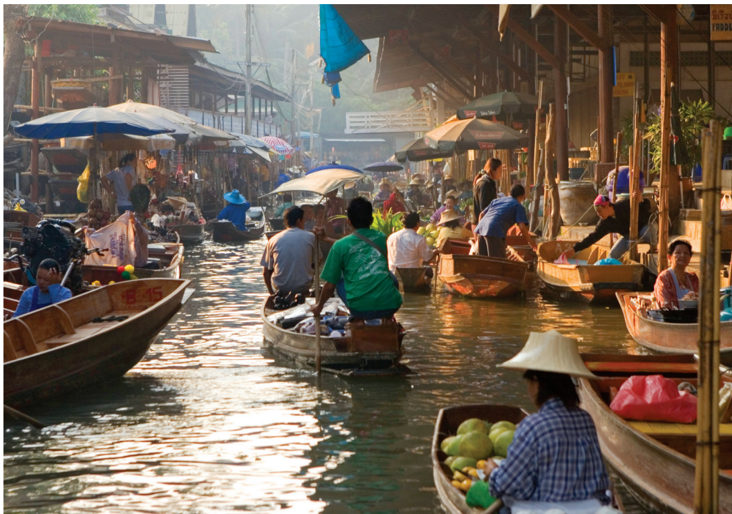
Visit the Damnoen Saduak Floating Market on Day 5.

sample some of the local goods and tropical fruits, and learn about the important role rice plays in Thai life. Before returning to our hotel, we see the wooden bridge of the Tham Krasae Death Railway. B,L,D