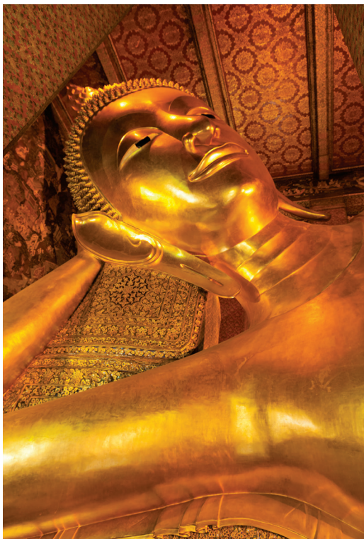
See the Reclining Buddha at Wat Pho, Bangkok.