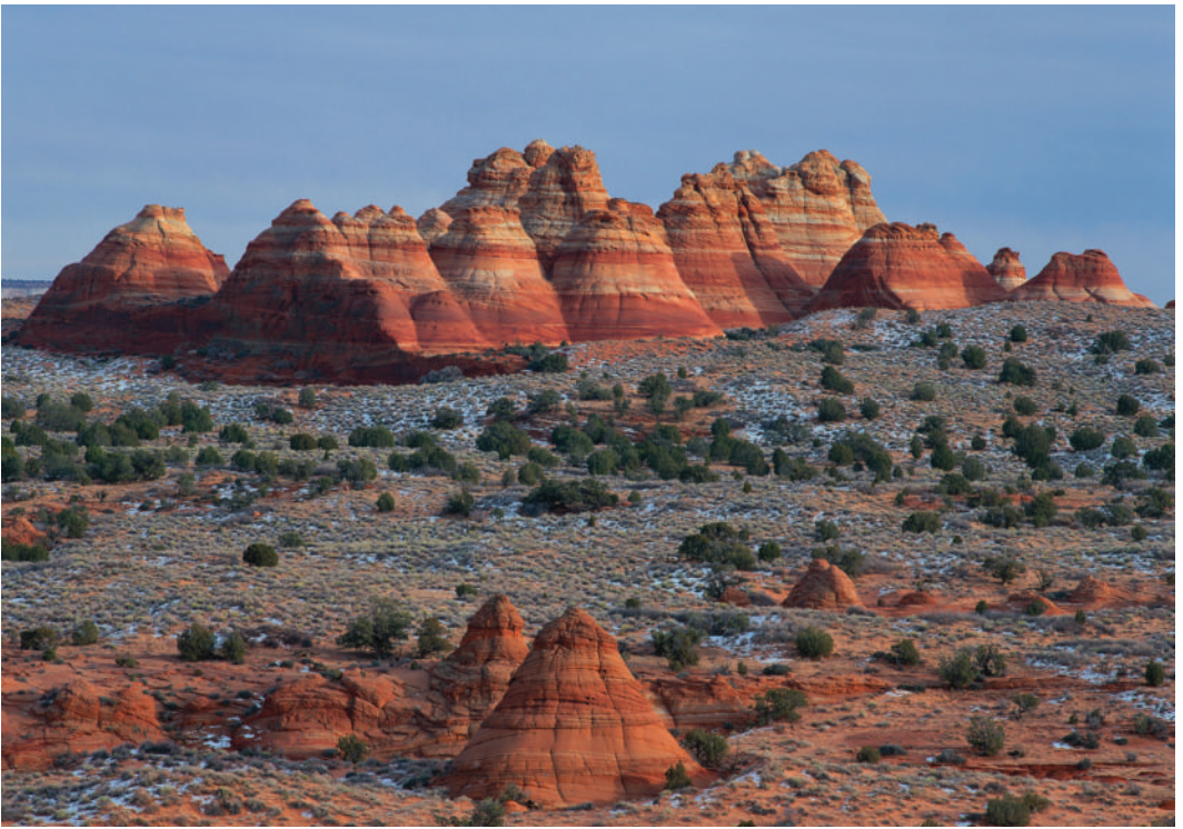
We experience the dramatic landscape of Badlands National Park on Day 2.

archetypical American profession, the hardworking cowboy still performs many of the same duties that his predecessors did two and three centuries back. During our visit we meet the cowboys and ranch hands and learn about their way of life. Then we enjoy a barbecue lunch before returning to Sheridan, where our afternoon is at leisure in this classic Western town. Tonight we enjoy dinner together. B,L,D