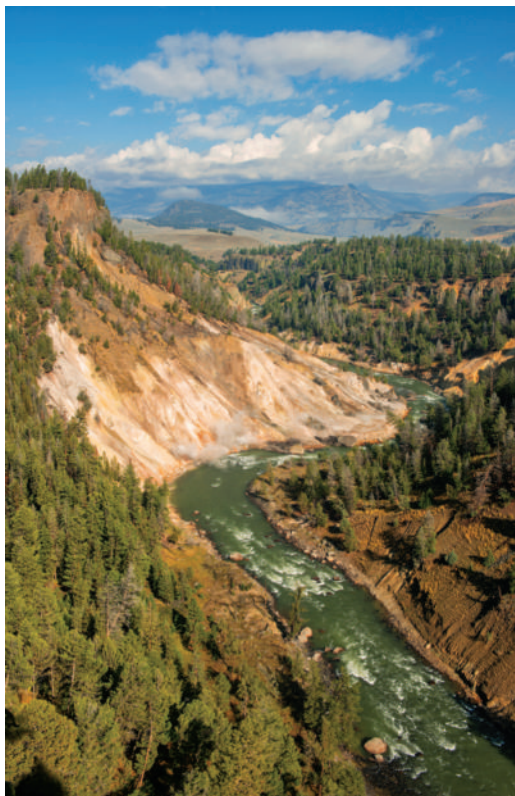
We see Yellowstone's stunning Grand Canyon on Day 6.