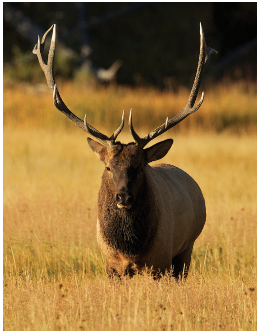
We hope to see wildlife at Yellowstone National Park.

Day 7: Cody/Yellowstone National Park/Grand Teton National Park/Jackson Hole More stunning Western scenery is on offer today as we traverse two of America's great national parks. This morning we re-enter Yellowstone, seeing first Yellowstone Lake. The park's largest body of water, Yellowstone Lake offers beautiful panoramic views. We have time for lunch on our own in the park before continuing on to world-famous Old Faithful. One of the most predictable geothermal features on Earth, Old Faithful blasts a plume of boiling water up to 180 feet in the air every 80 to 100 minutes, without fail. We witness this awe-inspiring natural event then depart on the