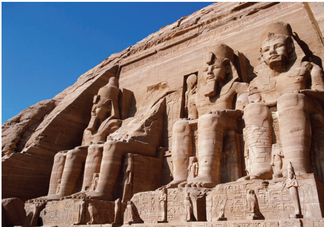
The magnificent temples at Abu Simbel commemorate Ramses II and his queen, Nefertari.

Day 8: Disembark/Aswan/Embark Nile Cruise Ship We set out early this morning to visit New Kalabsha, site of the largest freestanding Nubian temple, which was relocated here for the construction of the Aswan Dam. We return to our ship for breakfast then bid farewell to the crew as we embark on a tour of the Aswan High Dam. Next we visit the imposing temple to Isis on Agilkia Island before boarding our Nile cruise ship. This afternoon we embark small felucas , replicas of ancient Nile sailboats, for a relaxing sail. Back on board our ship tonight we enjoy the Captain's welcome cocktail party. B,L,D