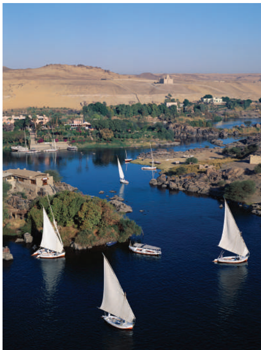
Traditional feluccas sail the Nile.

Day 15: Depart for U.S. Very early this morning we transfer to the airport for our return flight to the U.S. B