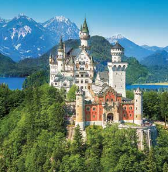
Admire enchanting Neuschwanstein Castle, built by King Ludwig II of Bavaria in 1886.

PRSR STD U.S. Postage PAID Gohagan & Company