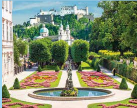
Stroll through the Baroque pleasure gardens of Mirabell Palace in the heart of Salzburg.

After lunch on board the ship, visit the UNESCO World Heritage-designated