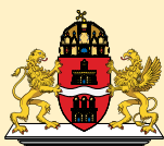
Budapest Coat of Arms

Budapest's majestic hills and artistic, bohemian avenues are sure to captivate you. Visit the stately, Gothic Revival-style Parliament Building, one of Europe's oldest legislative buildings and Hungary's largest; and enjoy an excursion into Hungary's great, protected Puszta (plains), for an expert display of master horsemanship and a traditional regional lunch—an authentic and unforgettable experience. Enjoy river-view accommodations for two nights in the Five-Star INTERCONTINENTAL BUDAPEST.