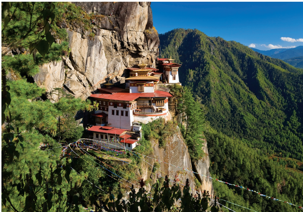
We climb to Tiger's Nest Monastery on Day 13.

Day 5: Kathmandu/Nagarkot Leaving Kathmandu today, we stop at Nepal's oldest and holiest Hindu shrine, ornate Pashupatinath Temple. At this UNESCO site we see sadhus and sages who, in following the lifestyle of Lord Shiva, wear loincloths and cover themselves with ashes. We also may witness cremation ceremonies along the river banks; displaying appropriate respect to the mourners is requested of all visitors. Traveling on, we reach Bhaktapur, another UNESCO site and the least developed of the valley's three cities. Virtually a living open-air museum with its unspoiled ancient square and warrens of medieval streets, Bhaktapur is known for its fine artisans and many temples. We have time to explore then continue the scenic drive to Nagarkot, a hilltop village commanding a spectacular vista of Nepal's major Himalayan peaks. B,L