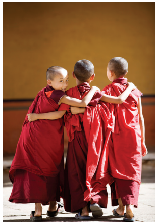
Young Buddhist monks

Day 12: Paro We begin our tour of this historic town at Ta-Dzong, the national museum showcasing Bhutan’s rich cultural heritage dating from at least 2000 BCE to the present day; then Rinpung Dzong, a superb example of Bhutanese architecture. After lunch we visit the sacred 7 th -century pilgrimage temple of Kyichu Lhakhang. We dine together tonight at our hotel. B,L,D