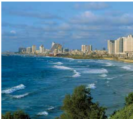
Sophisticated seaside Tel Aviv

Day 12: Depart Tel Aviv for U.S. Very early this morning we transfer by motorcoach to Tel Aviv for our return flight to the United States. B