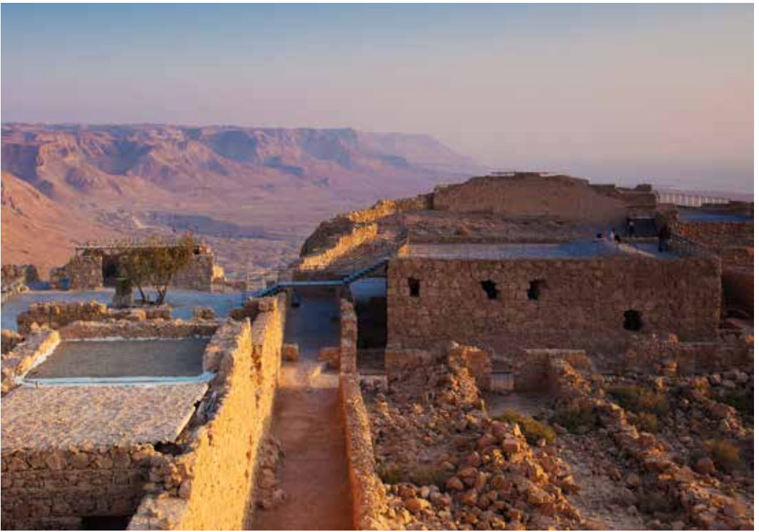
We explore the ruins at legendary Masada on Day 8.

Nazareth, now a center of Christian pilgrimage. Here we visit the Church of the Annunciation, the largest church in the Middle East and where the archangel Gabriel told the Virgin Mary that she would give birth to Jesus. We enjoy lunch at a family-run dairy farm then continue to Safed, center of Jewish mysticism, home to many artists, and where we stroll the medieval streets. We visit some of the galleries here before returning to our hotel, where we dine tonight. B,L,D