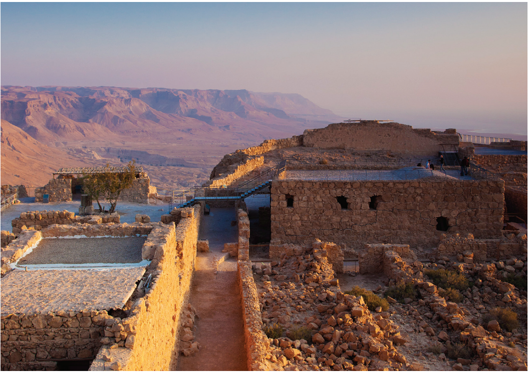
We explore the ruins at legendary Masada on Day 8.

Nazareth, now a center of Christian pilgrimage. Here we visit the Church of the Annunciation, the largest church in the Middle East and where the archangel Gabriel told the Virgin Mary that she would give birth to Jesus. We enjoy lunch at a family-run dairy farm then continue to Safed, center of Jewish mysticism, home to many artists, and where we stroll the medieval streets. We visit some of the galleries here before returning to our hotel, where we dine tonight. B,L,D