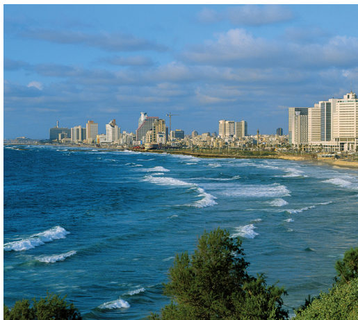
Sophisticated seaside Tel Aviv

Day 12: Depart Tel Aviv for U.S. Very early this morning we transfer by motorcoach to Tel Aviv for our return flight to the United States. B