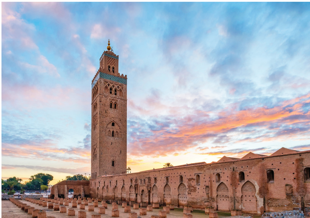
We see the distinctive Koutoubia Mosque – Marrakech’s largest – on Day 11.

Day 6: Fez Today’s touring features the Museum of Fez, housing traditional arts. Then we embark on a walking tour of the medina focusing on the artisans’ quarters, the 14 th -century Koranic schools, and Al Karaouine, the medieval theological university. The remainder of the afternoon is free for independent exploration and lunch on our own. Tonight, we enjoy a private dinner at an intimate family-run riad in Fez. B,L,D