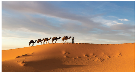
We watch the sun set over the Sahara on Day 8.