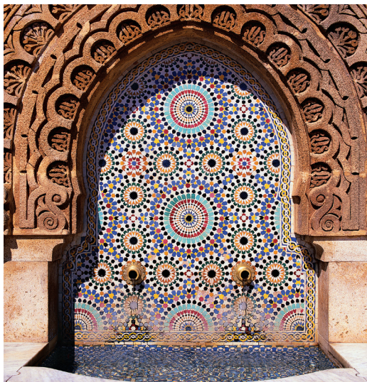
Traditional Moroccan tile work

En route to Marrakech today, we stop first at uninhabited Ait ben-Haddou, a UNESCO World Heritage site and one of southern Morocco’s most scenic villages that is often used as a location for fashion and film shoots. Its old section consists of deep red kasbahs packed together so tightly they appear to be a single unit. Then, as we begin our descent from the High Atlas, we pass through typical villages with fortified walls and stone houses with earthen roofs. In Tizi N’Tichka, we traverse the Pass of the Pastures (alt. 7,415 feet), where life is much as it was centuries ago: