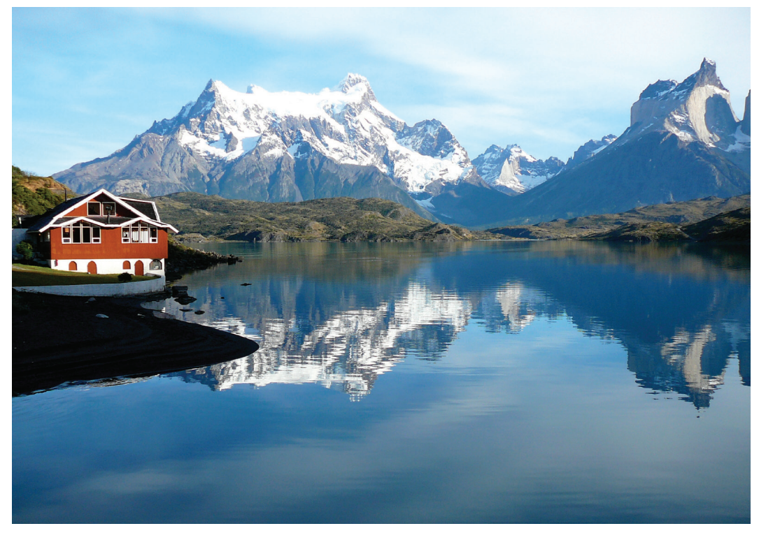
We see snowcapped mountain peaks, cascading rivers and waterfalls, glaciers, and mirrored lakes.