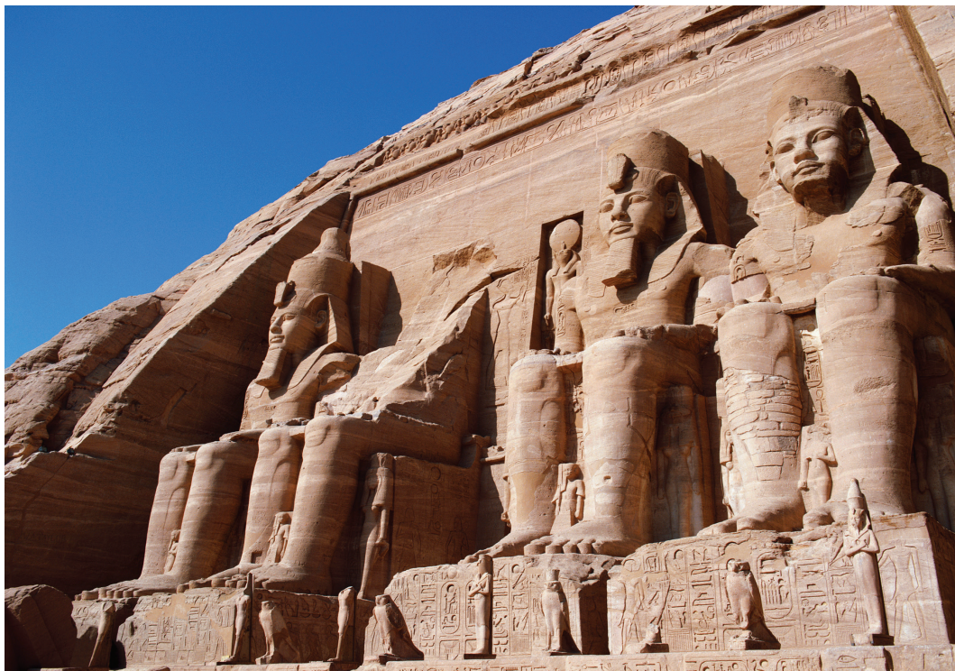
The magnificent temples at Abu Simbel commemorate Ramses II and his queen, Nefertari.

Returning to our ship, we sail on to Amada, where we encounter the oldest of Nubia's Egyptian temples, the 18 th -dynasty Temple of Amada. B,L,D