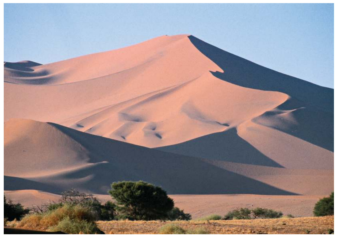
We explore the crested dunes at Sossusvlei, among the world's highest at 1,300 feet.

population (some 120,000), as well as zebra, lion, hippo, giraffe, impala, wildebeest, buffalo, and more. We're sure to see some of them on today's full-day excursion to Chobe, where we take a morning game drive and an afternoon game cruise. B , L , D