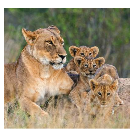
Lionness with her cubs

Day 18: Arrive U.S. We arrive in the U.S. today and connect with our flights home.